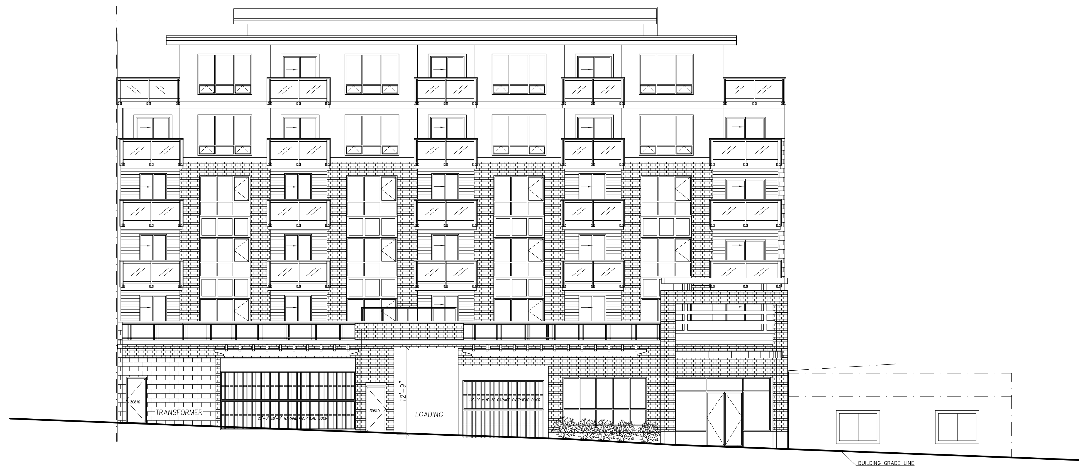
STREETSCAPE (ALONG EAST 19TH AVENUE)