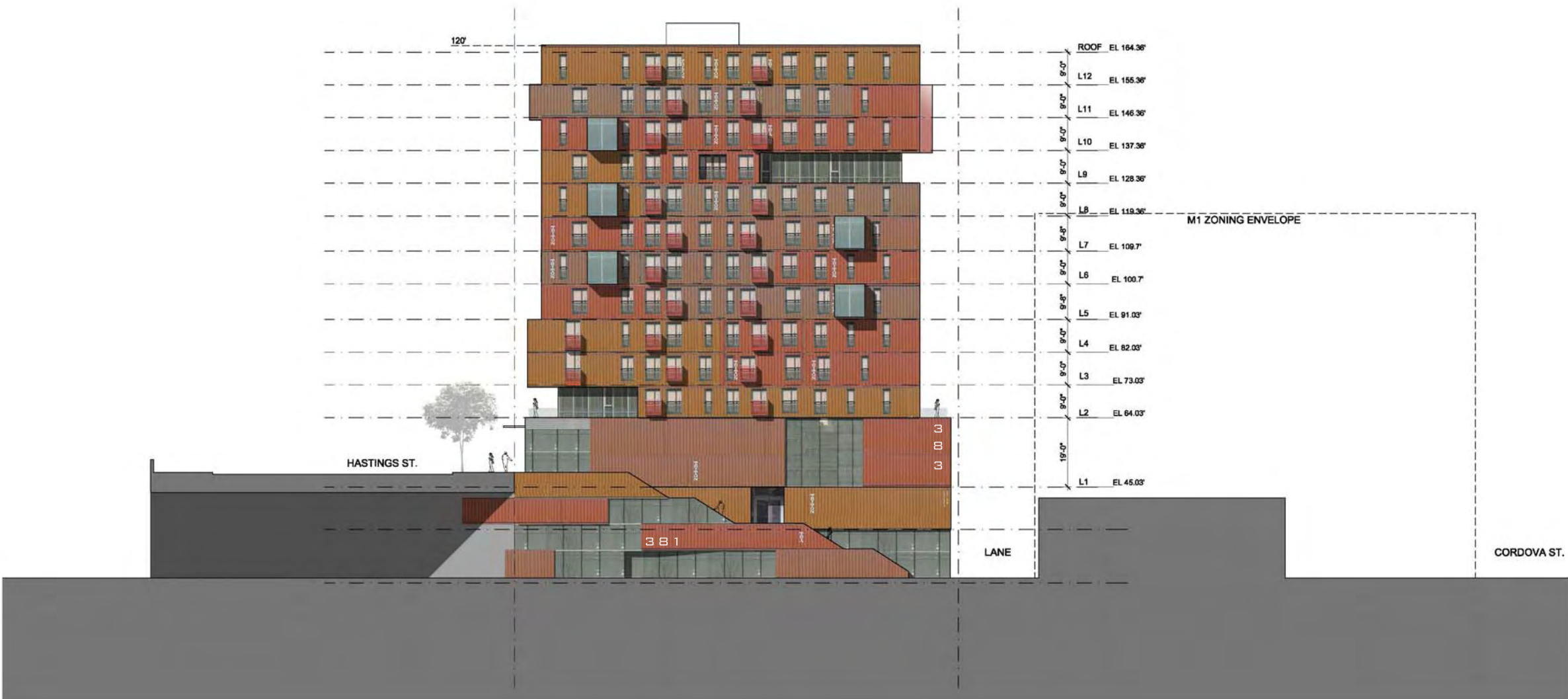
RAYMUR ST. ELEVATION - EAST

DATE DRAWN BY DE CHECKED BY SL SCALE 1/16" = 1'-0" JOB NUMBER 0587