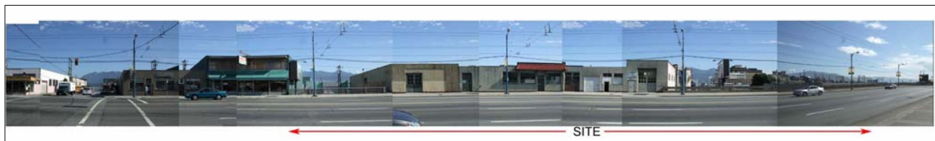
EAST HASTINGS STREET VIEW