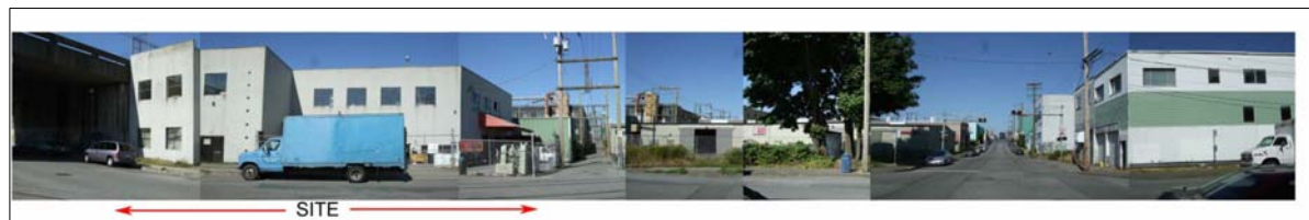
RAYMUR AVE. STREET VIEW