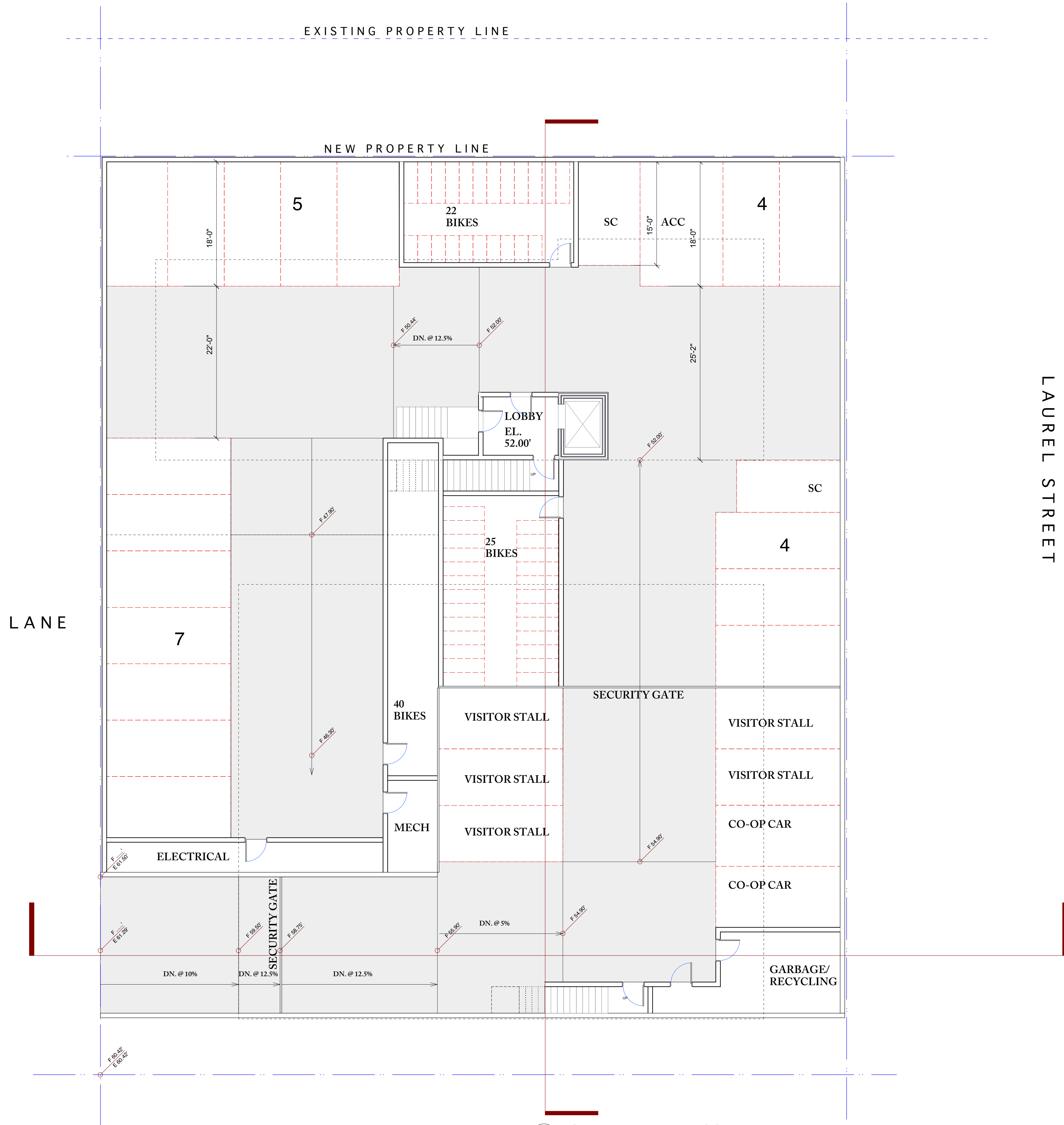
1 LOWER PARKADE FLOOR PLAN 1/8" = 1'-0"