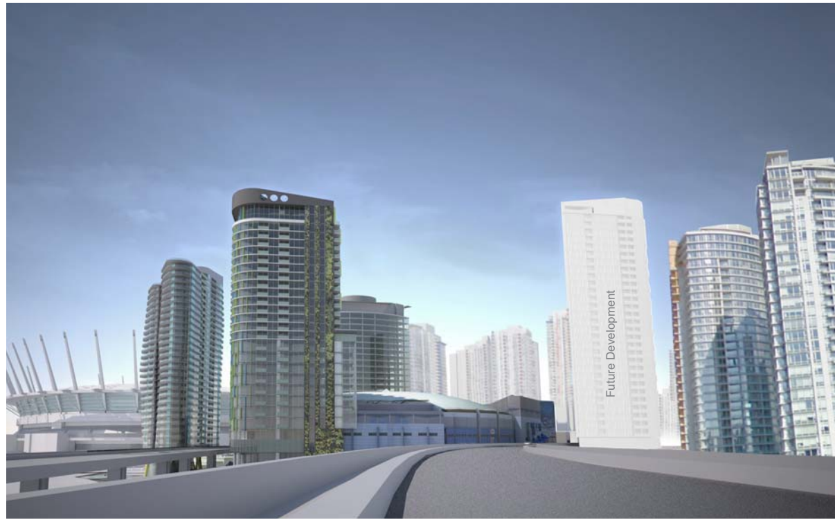
5.0.6 Rendering: Dunsmuir Approach