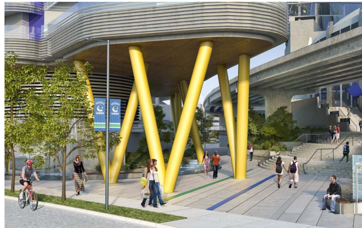
5.3.L03 Rendering: South Tower

WALTER FRANCL ARCHITECTURE INC. 1884 WEST 2ND AVE. VANCOUVER, B.C. V 6 J 1 H 4 P: 604.688.3252 F: 604.688.3996 WFRANCL.COM