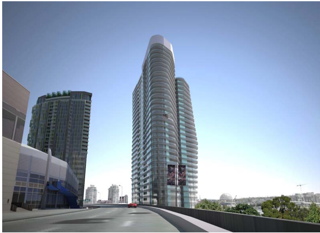
5.0.5 Rendering: Georgia Approach