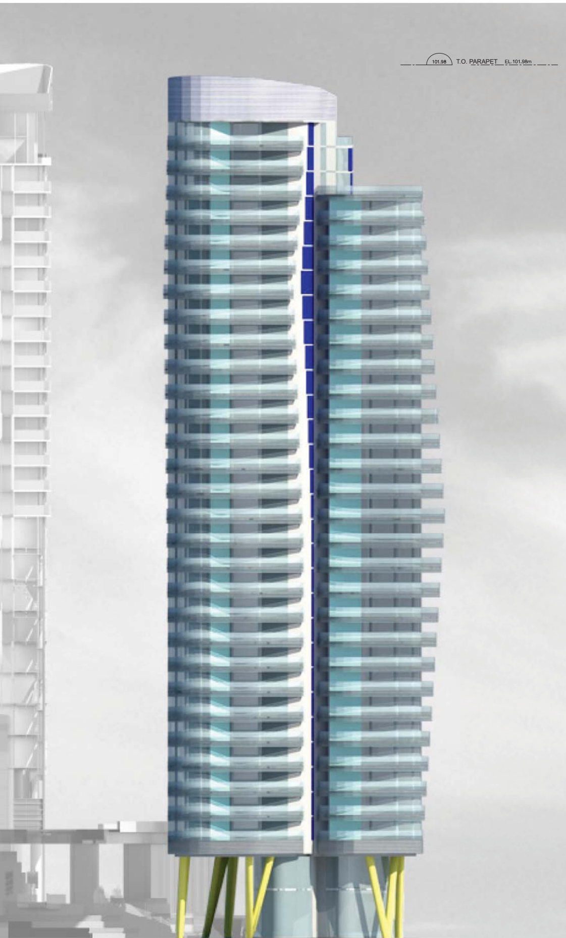
5.3.1 West Elevation