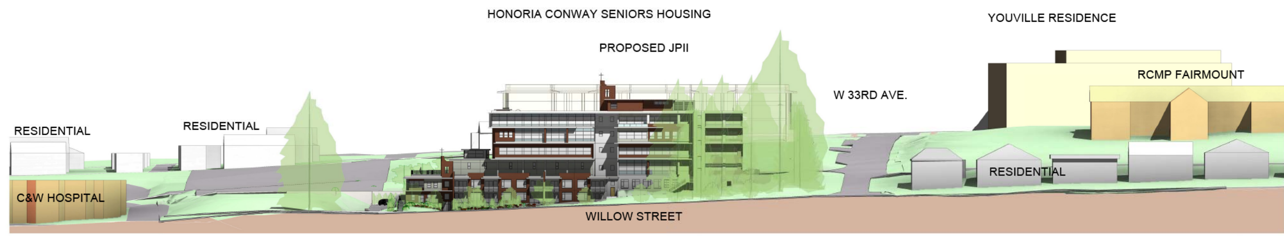
1 WEST ELEVATION A5.1 1:50