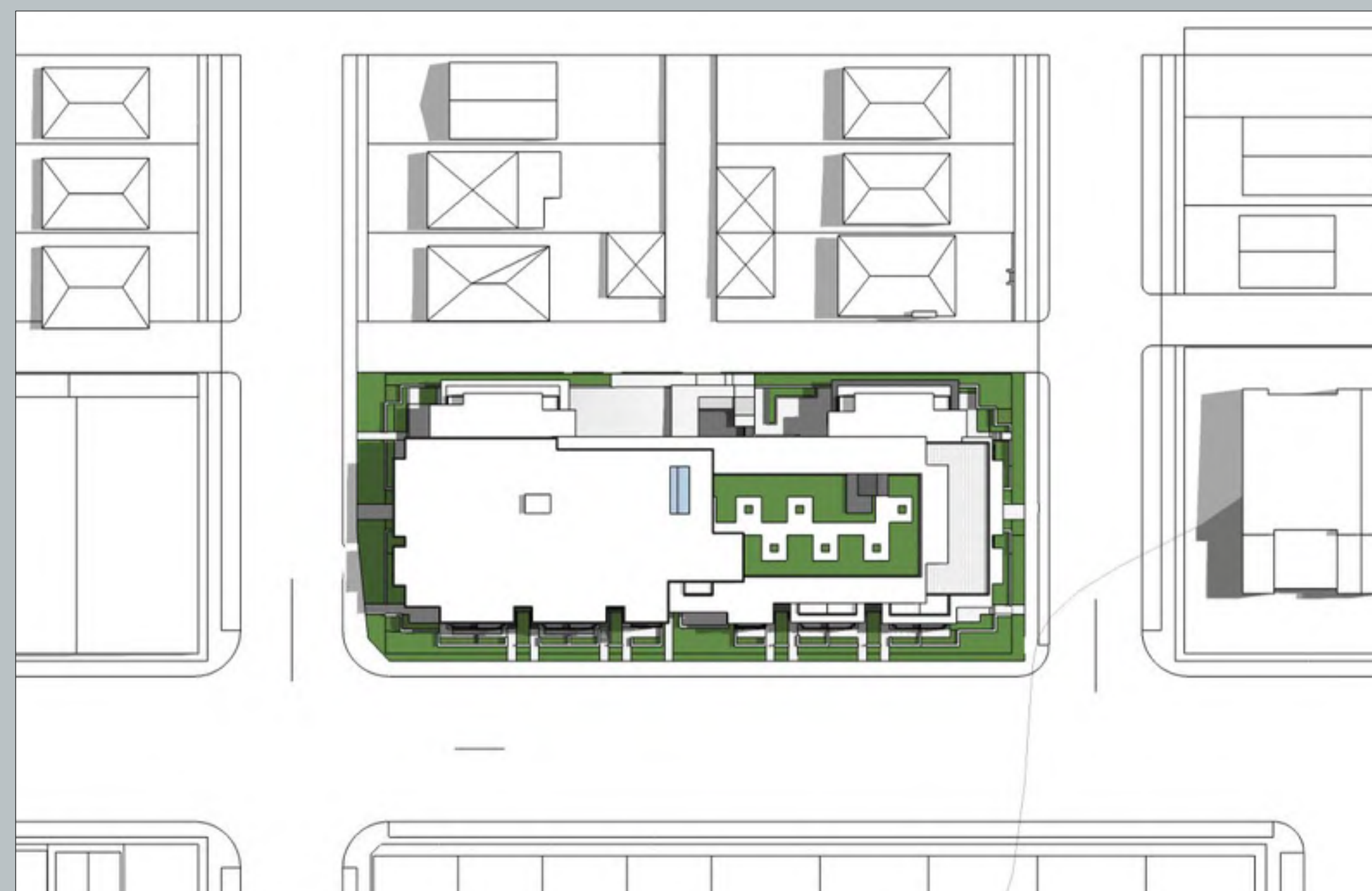
12:00 NOON - JUNE 21