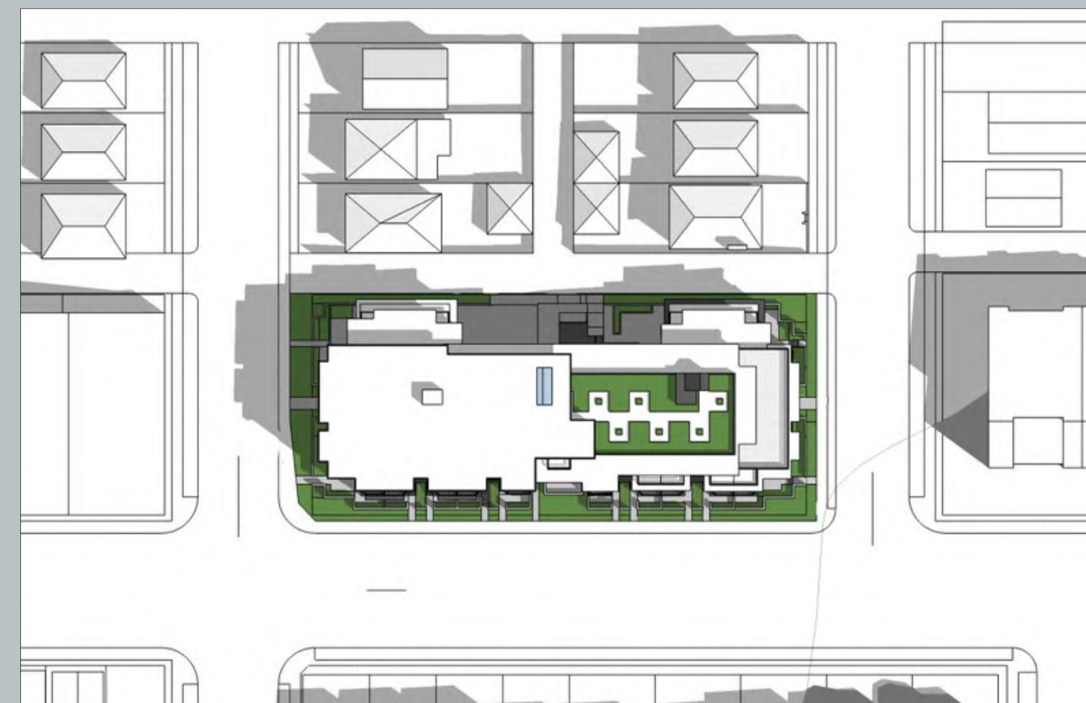
2:00 pm - MAR / SEPT 21