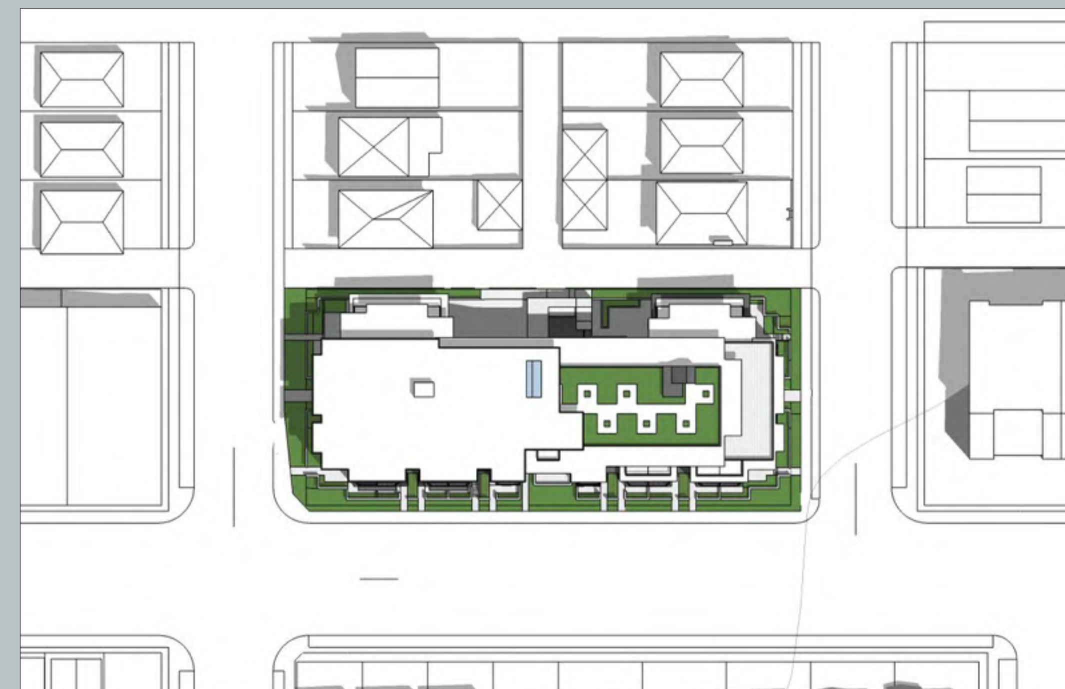
2:00 pm - JUNE 21