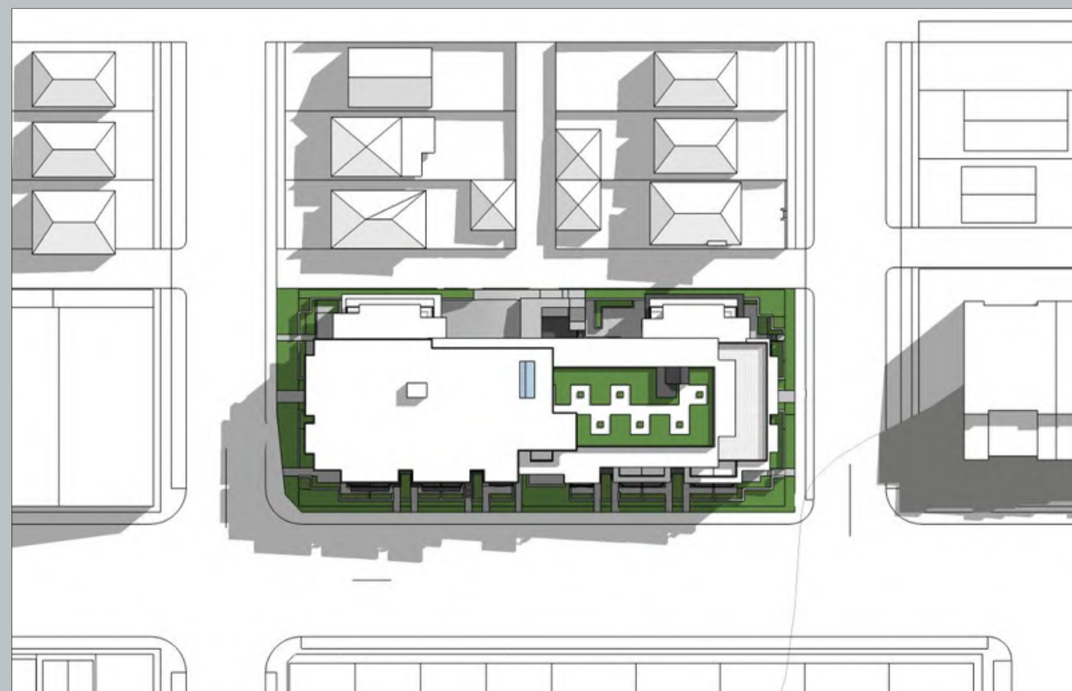
10:00 am - MAR / SEPT 21