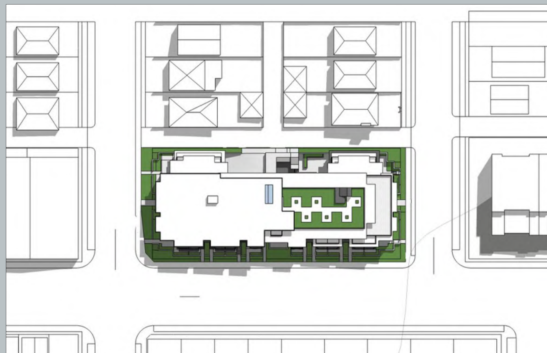
10:00 am - JUNE 21