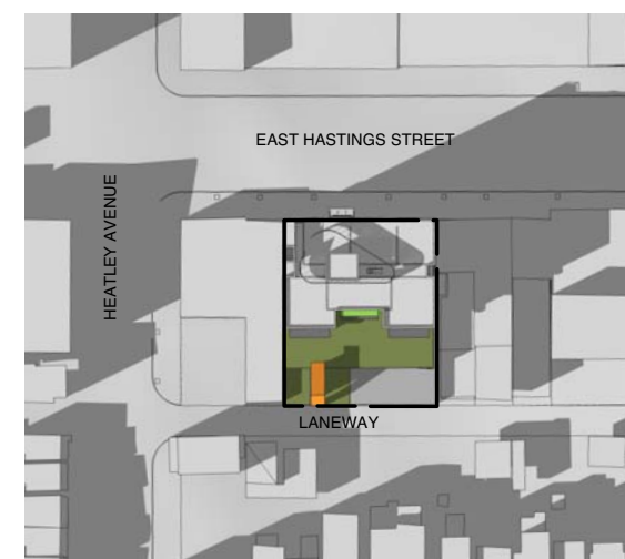
SEPT 21 4:00 PM