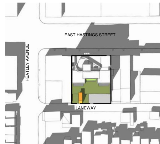
MARCH 21 2:00 PM