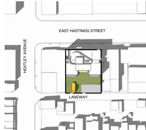
JUNE 21 2:00 PM