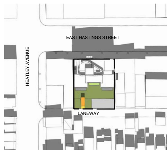
SEPT. 21 12:00 PM