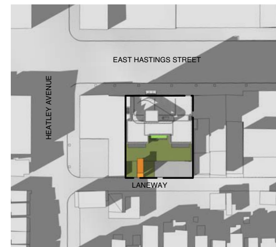
MARCH 21 4:00 PM