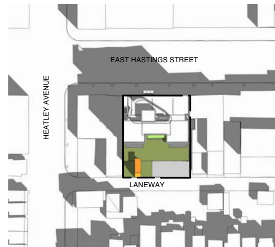
MARCH 21 10:00 AM