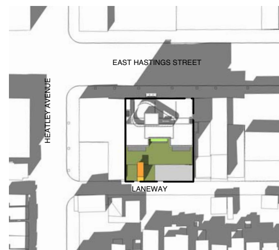
SEPT. 21 2:00 PM