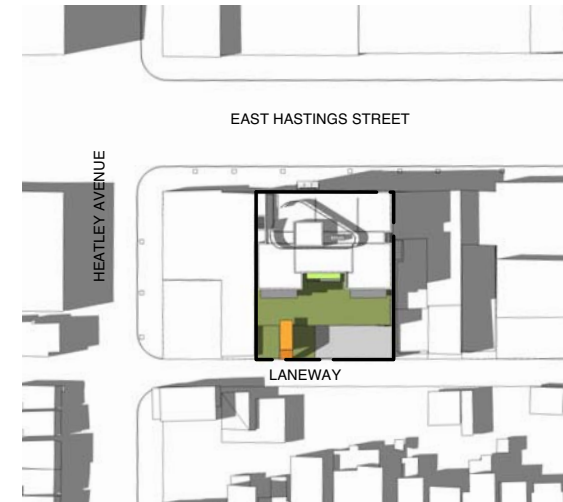
JUNE 21 4:00 PM