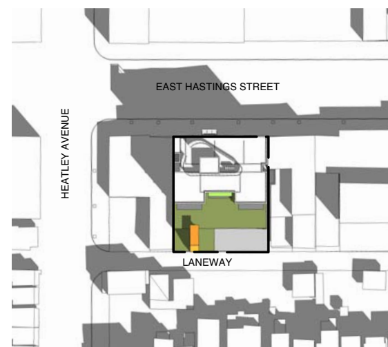
SEPT. 21 10:00 AM