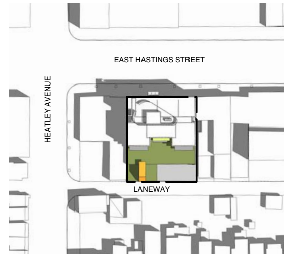
JUNE 21 10:00 AM