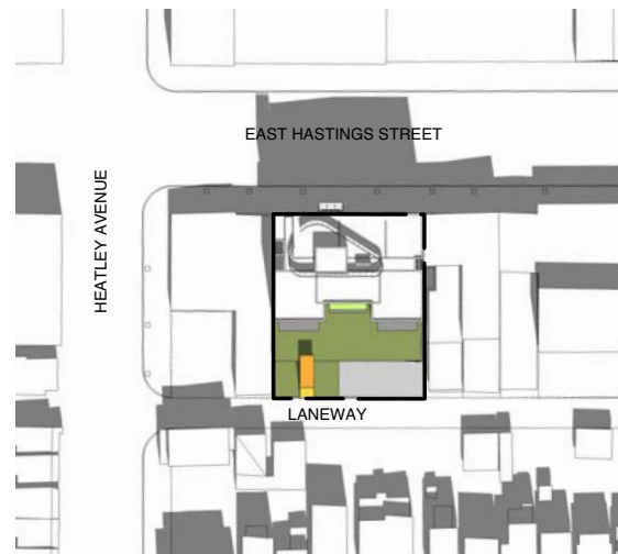
MARCH 21 12:00 PM