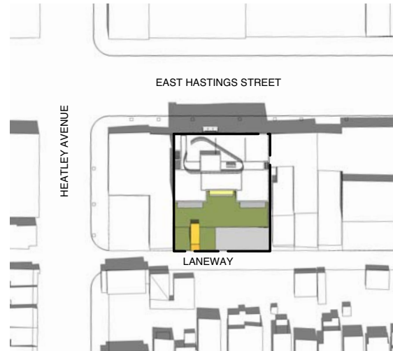
JUNE 21 12:00 PM