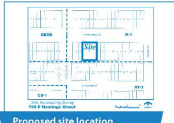
Proposed site location

For more info visit us at: vancouver.ca/rezapps