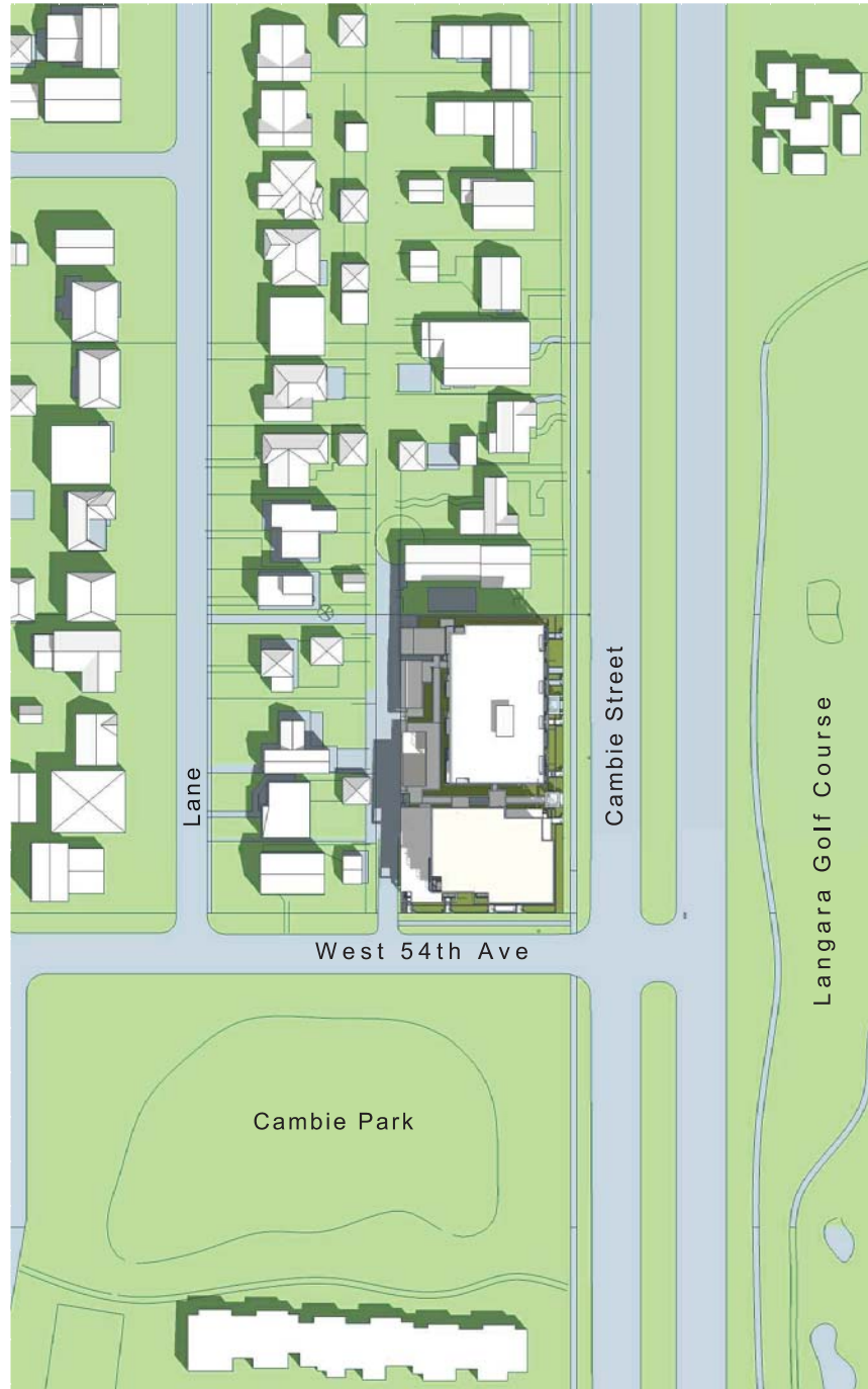
September / March 21 - 10am