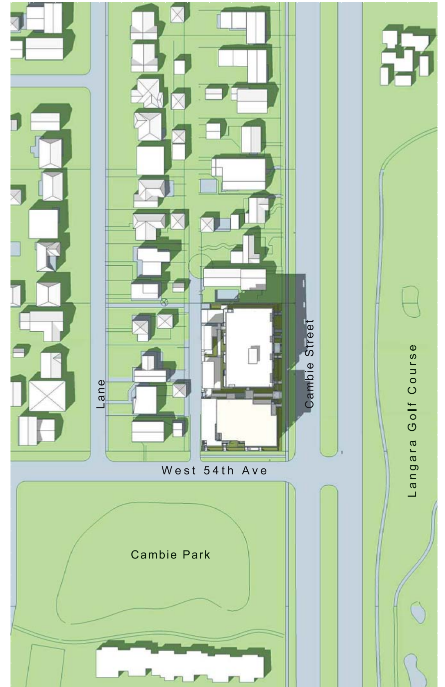
September / March 21 - 2pm