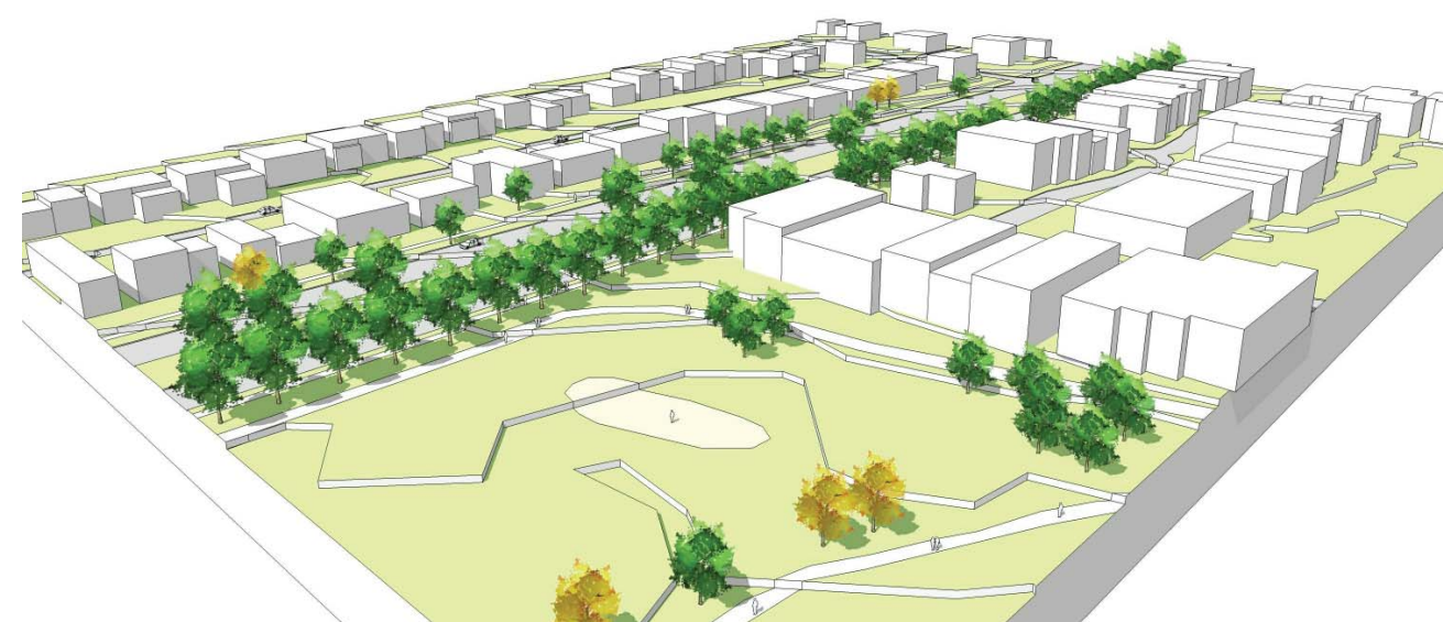
EXISTING CONTEXT MASSING