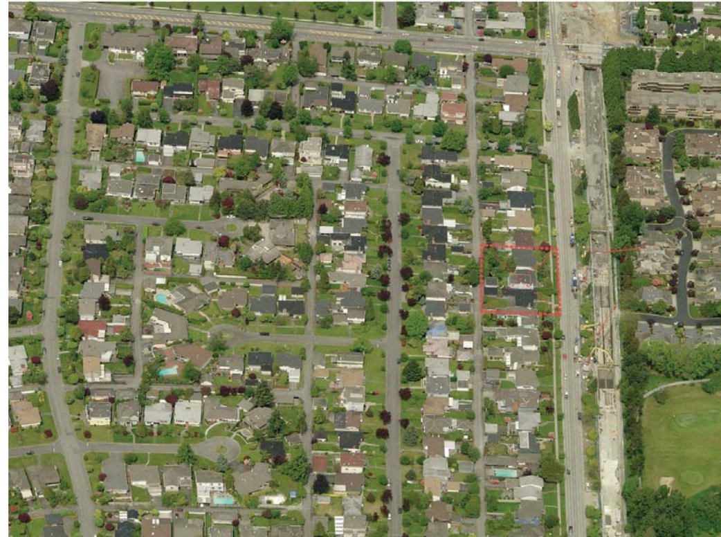
AERIAL VIEW FROM SOUTH