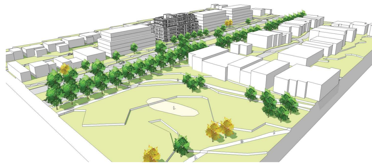
FUTURE CONTEXT MASSING