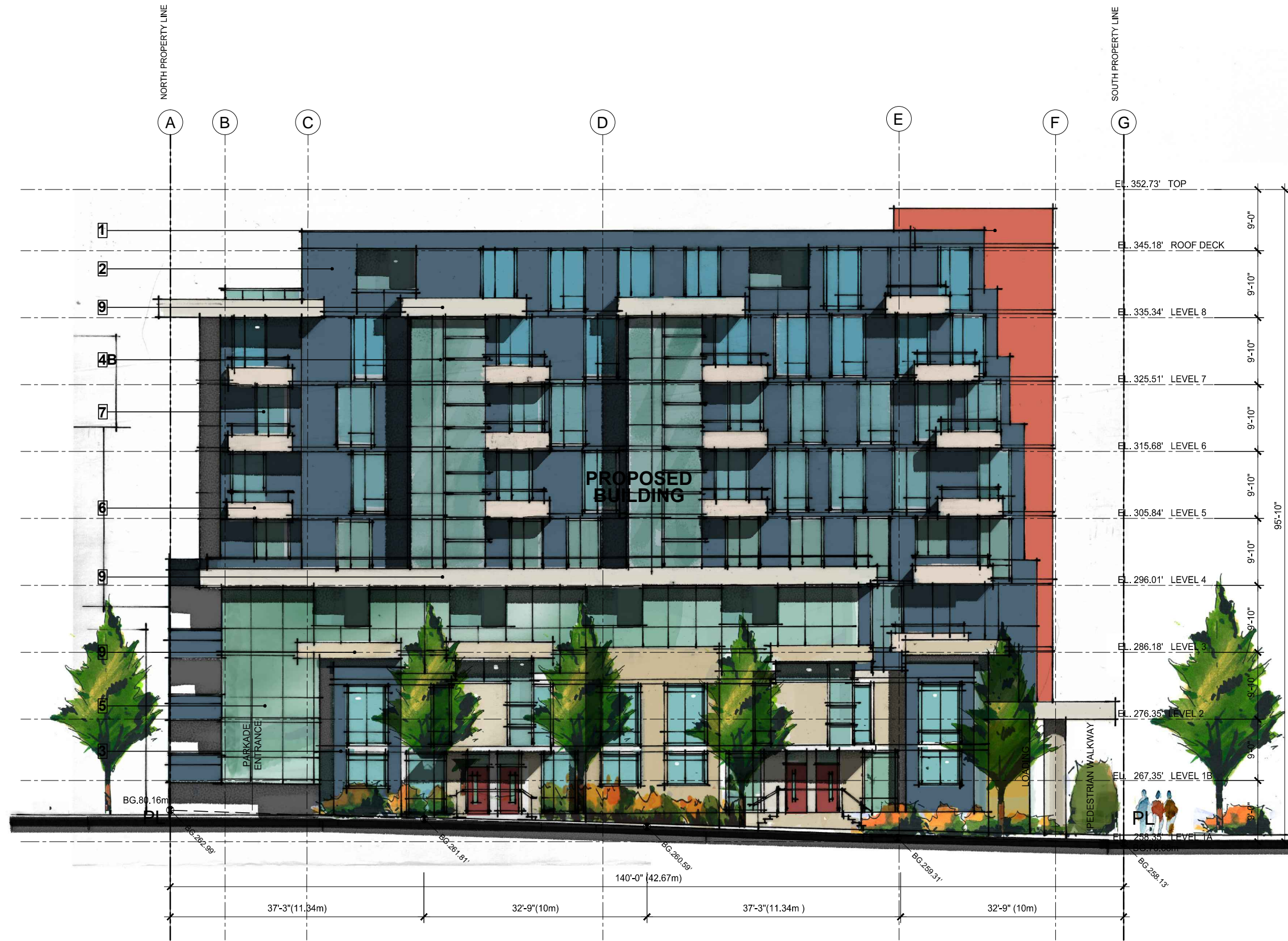
WEST ELEVATION ALONG LANE