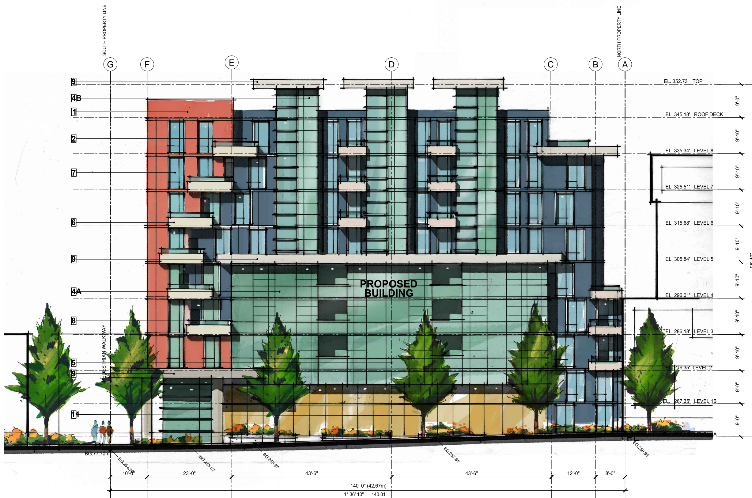
EAST FRONT ELEVATION ALONG CAMBIE STREET