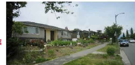
ALONG CAMBIE STREET - AT PROPOSED / SITE EXISTING HOUSE