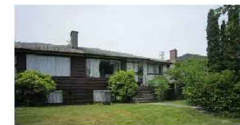
ALONG CAMBIE STREET - AT ADJACENT PROPERTY