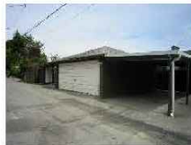
ALONG LANE - SUBJECT SITE