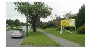
ALONG CAMBIE STREET - PROPOSED 6-STOREY DEVELOPMENT