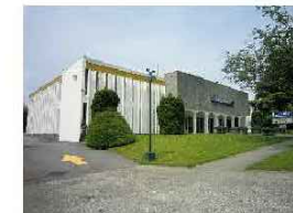
ALONG CAMBIE STREET - BAPTIST CHURCH