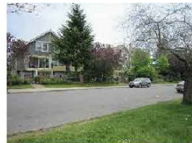
ALONG ASH STREET