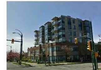
ALONG CAMBIE STREET - RESIDENTIAL 6-STOREY