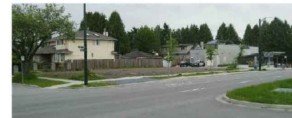
ALONG CAMBIE STREET - 49TH AVENUE RAV STATION