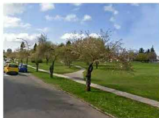
ALONG ASH STREET