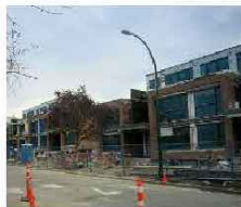
ALONG ASH STREET