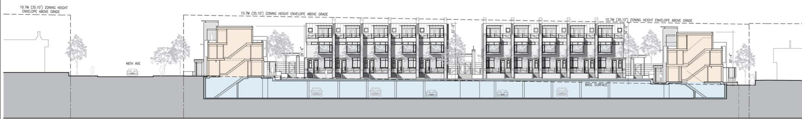
1 Long Section A4.01 SCALE: 1/16"=1'-0"