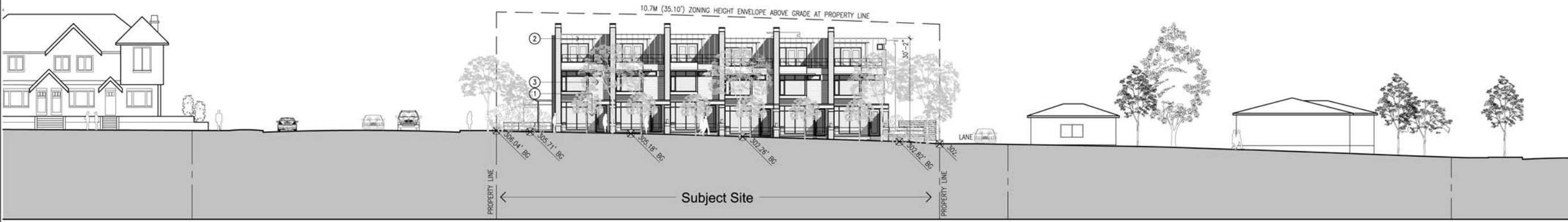
Building 6 ② 46TH AVENUE/SOUTH ELEVATION A3.01 SCALE: 1/16"=1'-0"