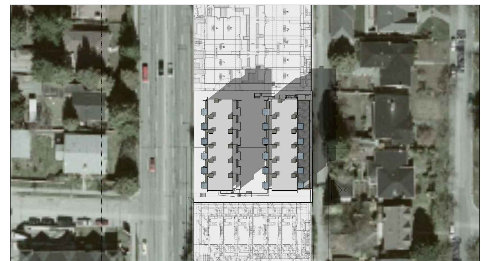
Sep 21, 3pm