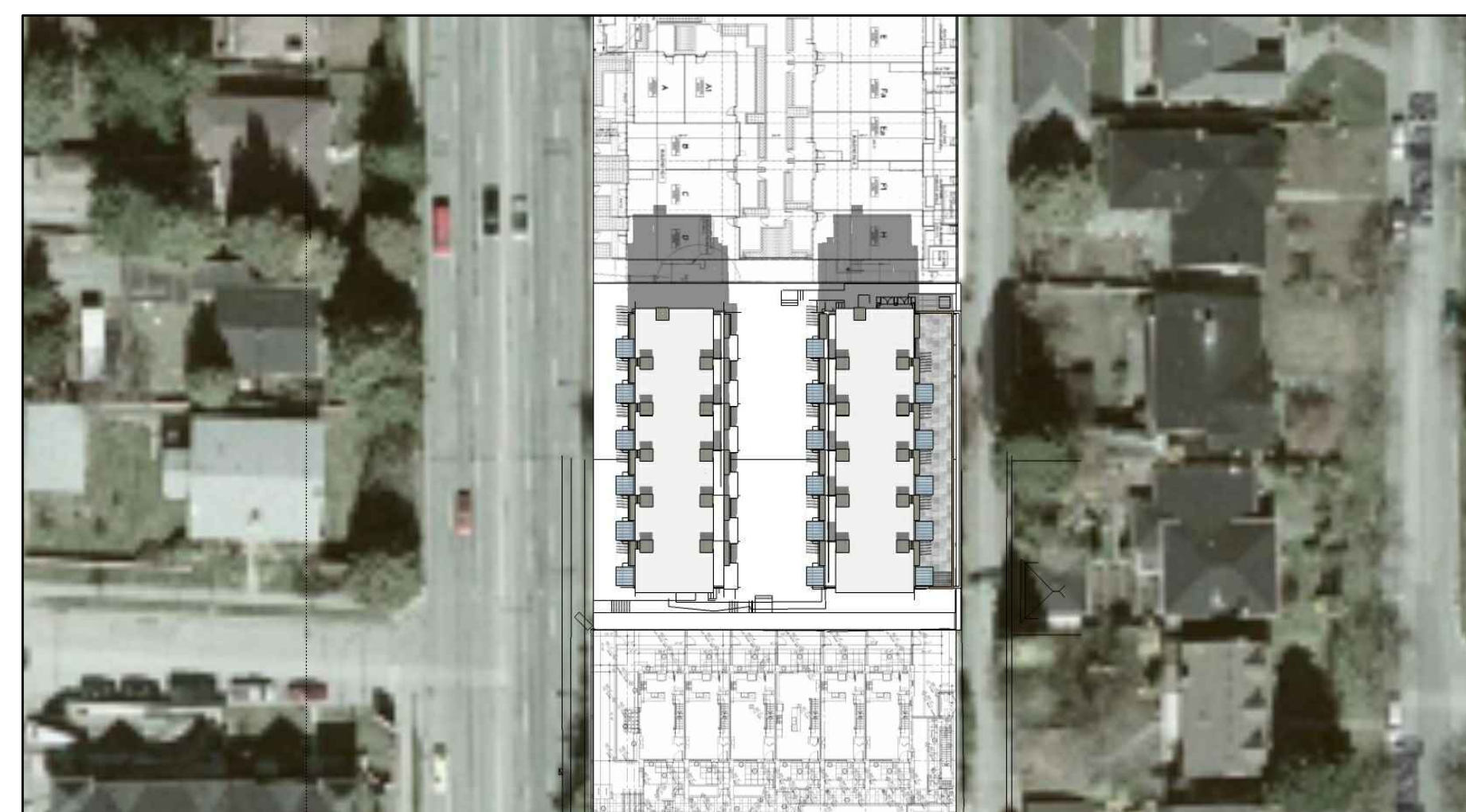
Sept 21, 12pm