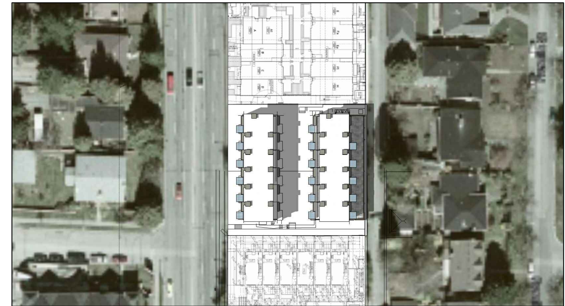
June 21, 3pm