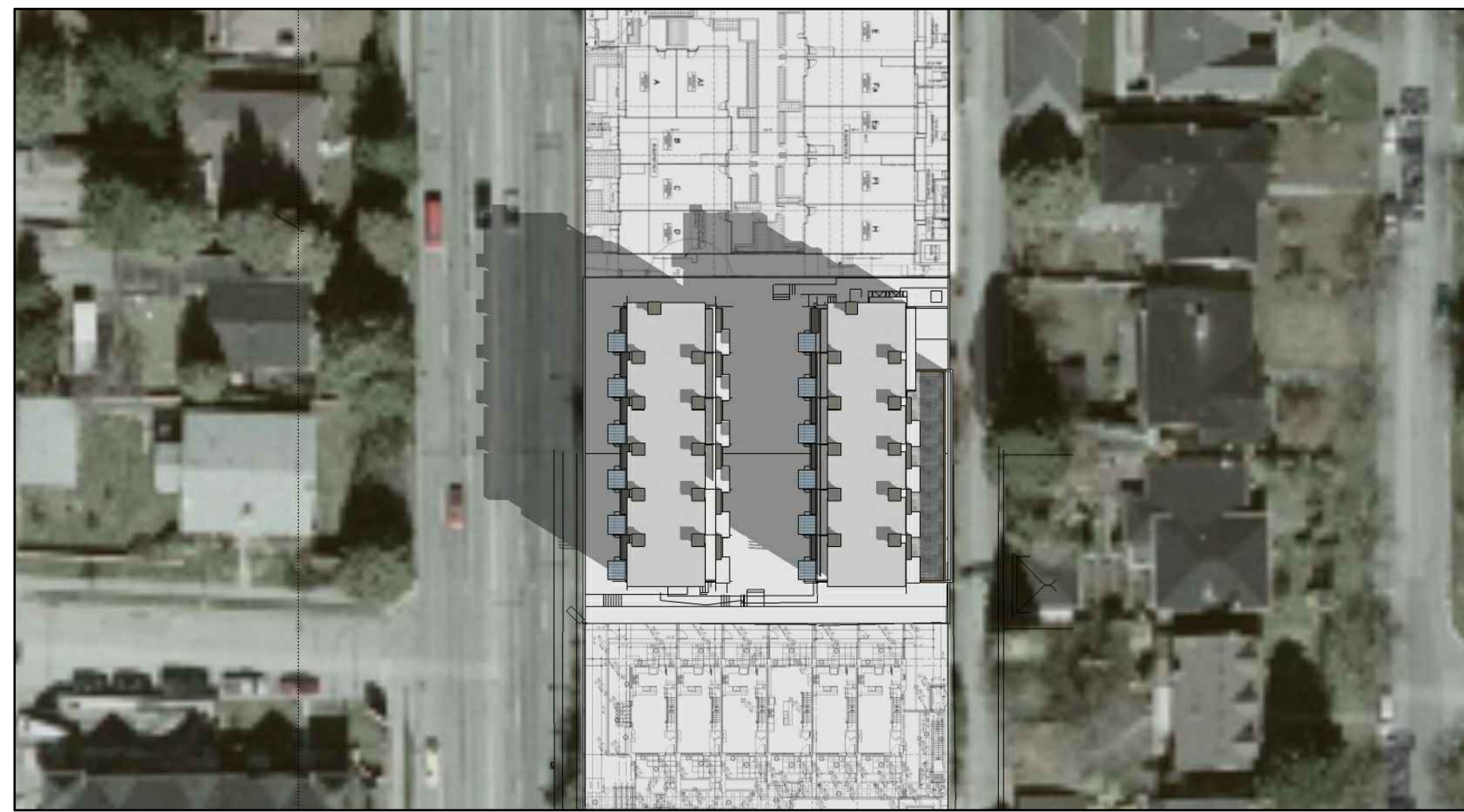
March 21, 9am