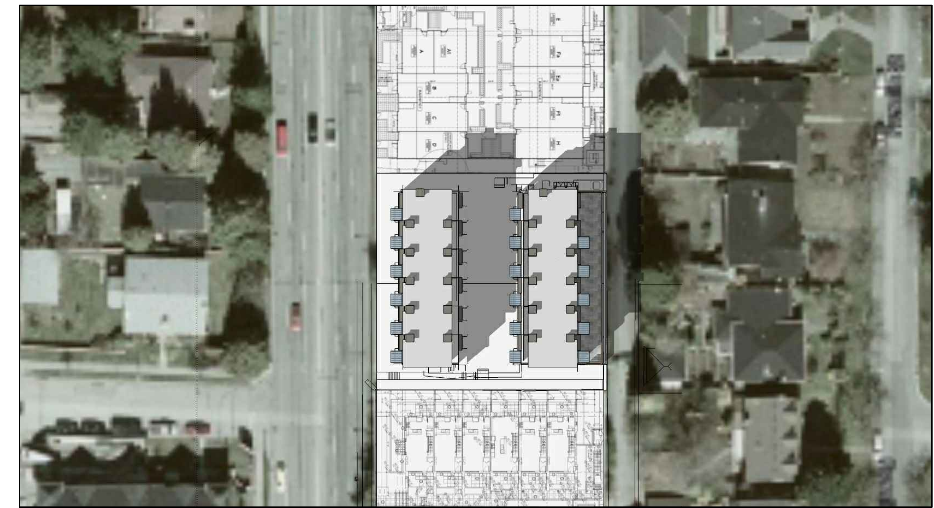
March 21, 3pm