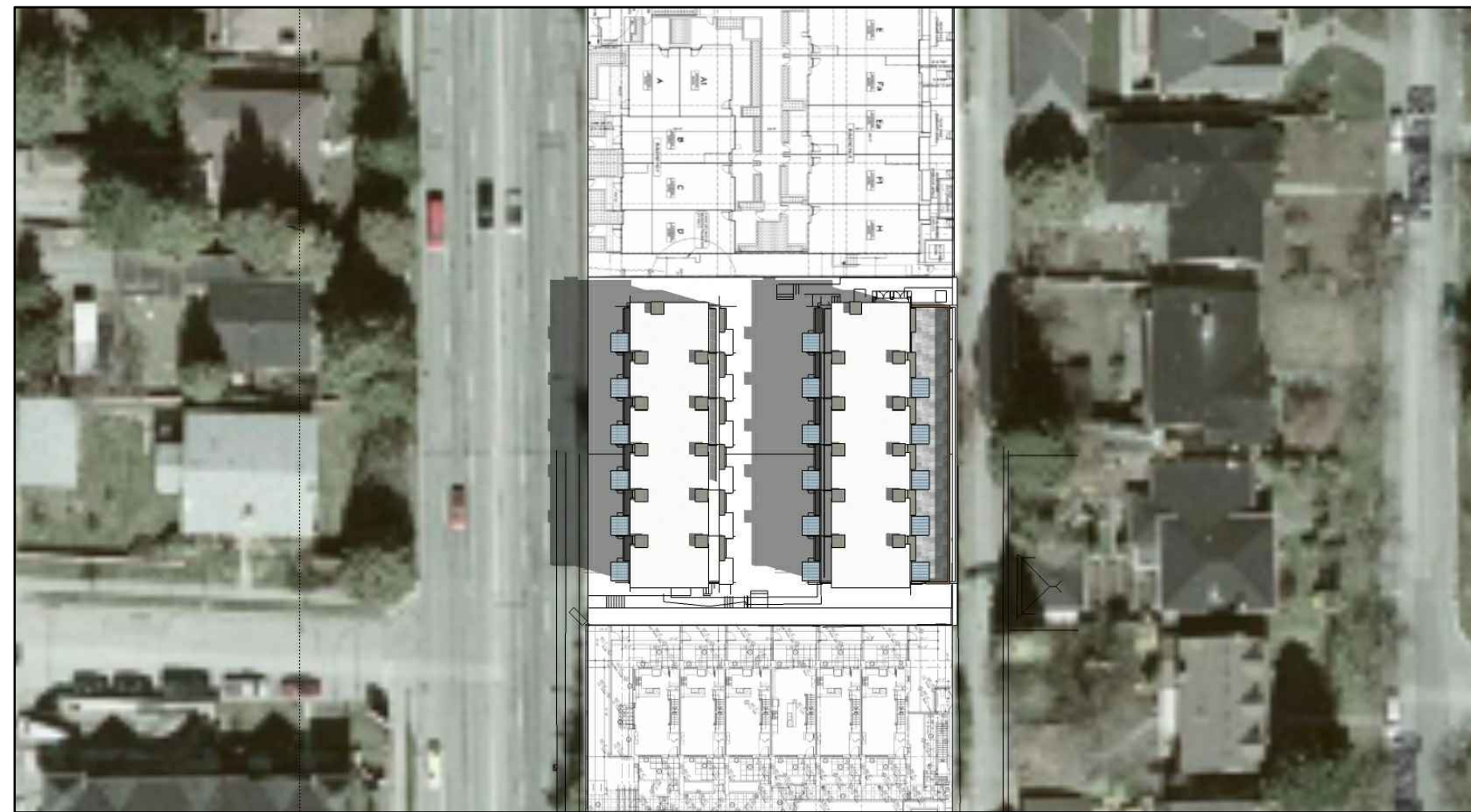
June 21, 9am