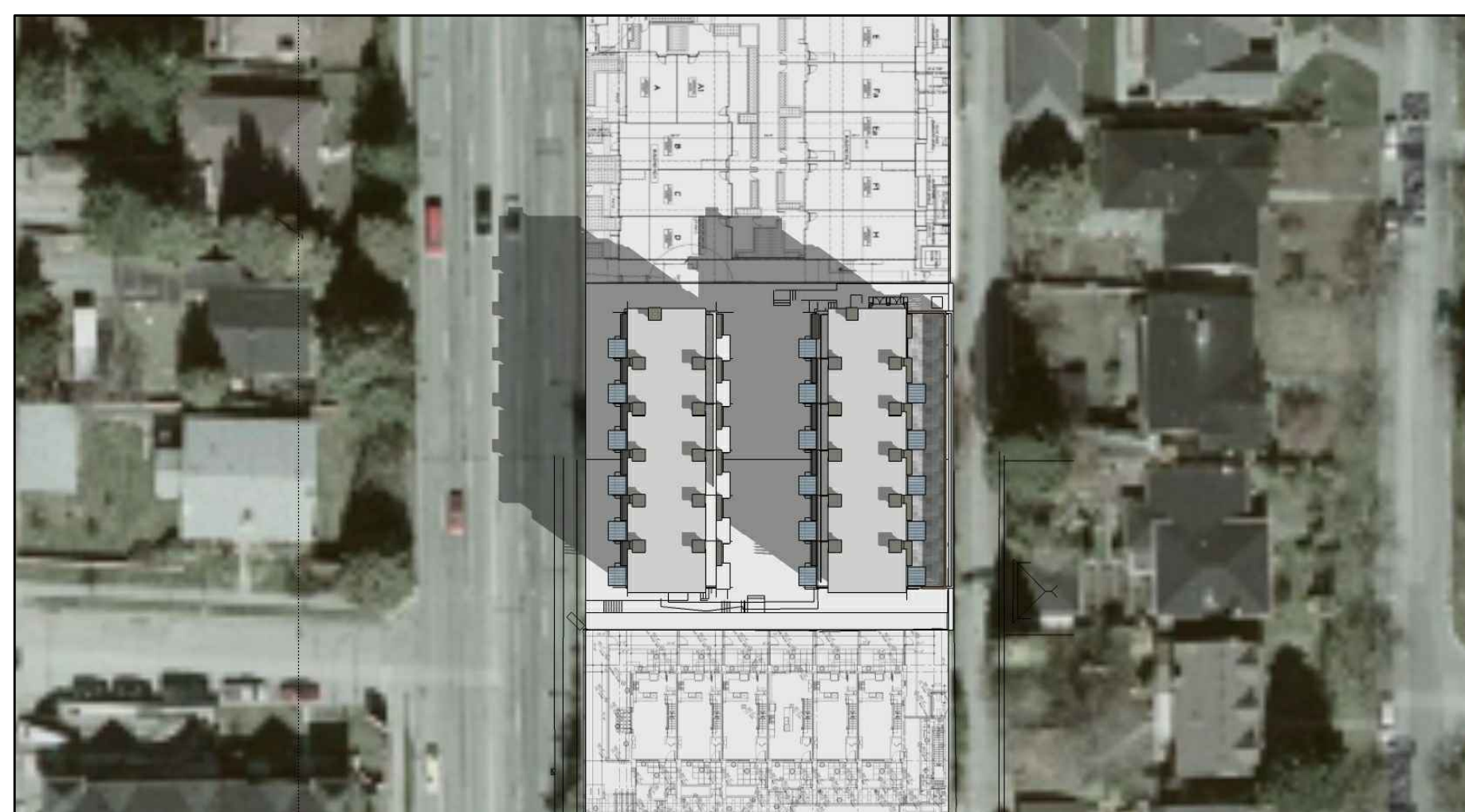
Sept 21, 9am