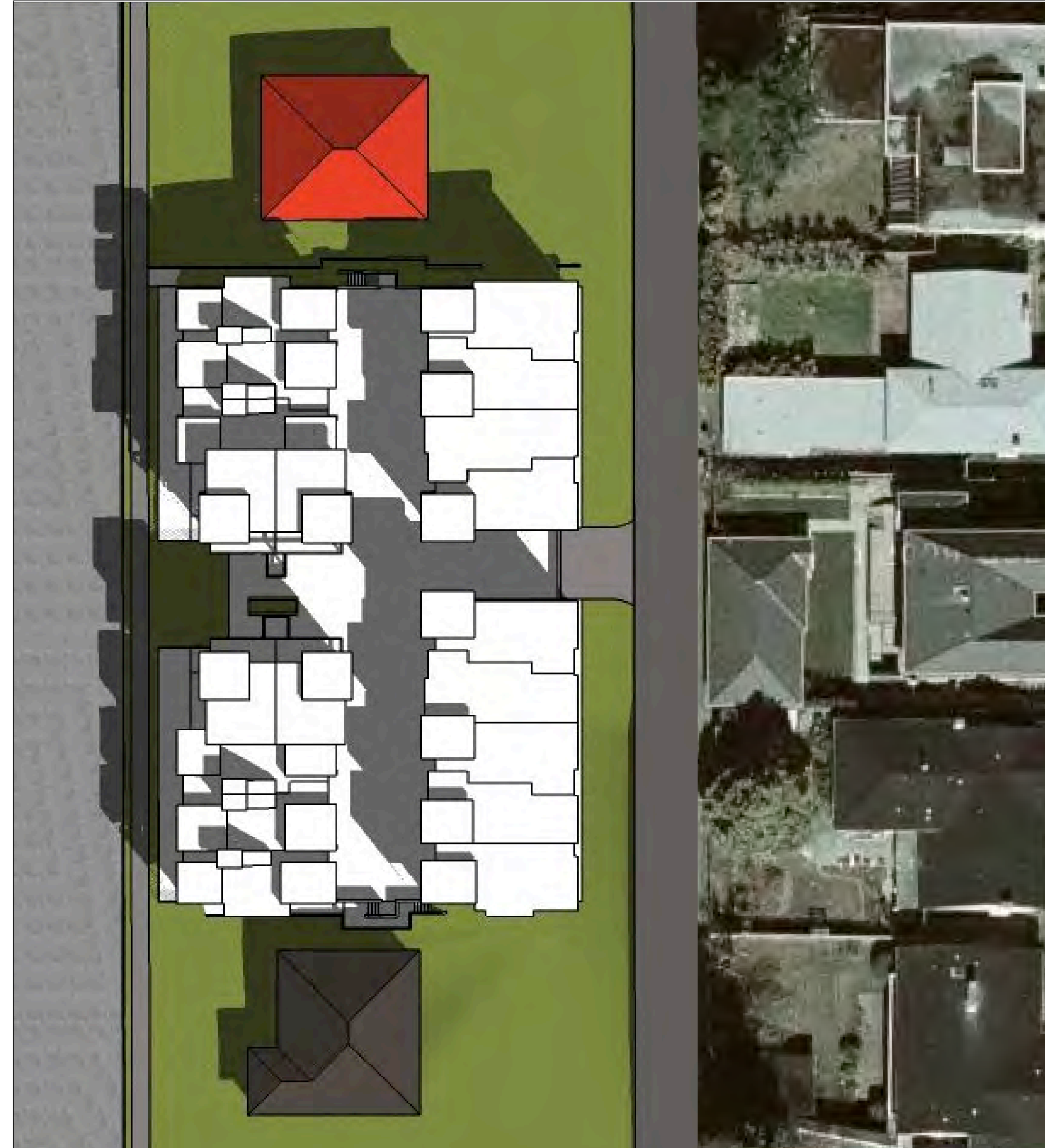
SEPT. 23 - 10:00