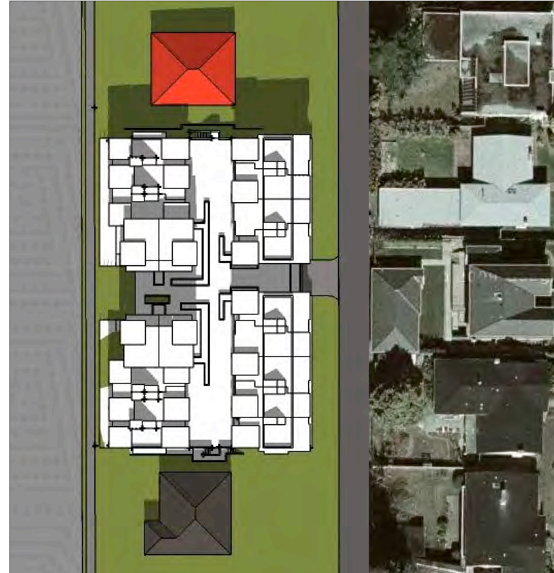
SEPT. 23 - 12:00