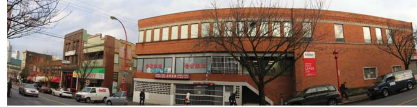
TO MAIN STREET KEEFER STREET LOOKING NORTH