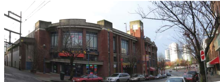
KEEFER STREET, CHINATOWN PLAZA