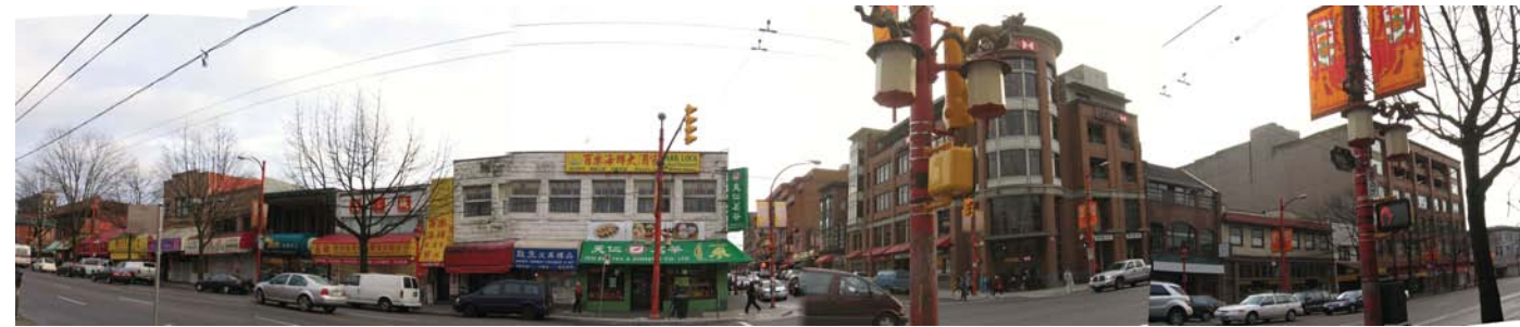
TO PENDER STREET KEEFER STREET TO GEORGIA STREET MAIN STREET LOOKING EAST