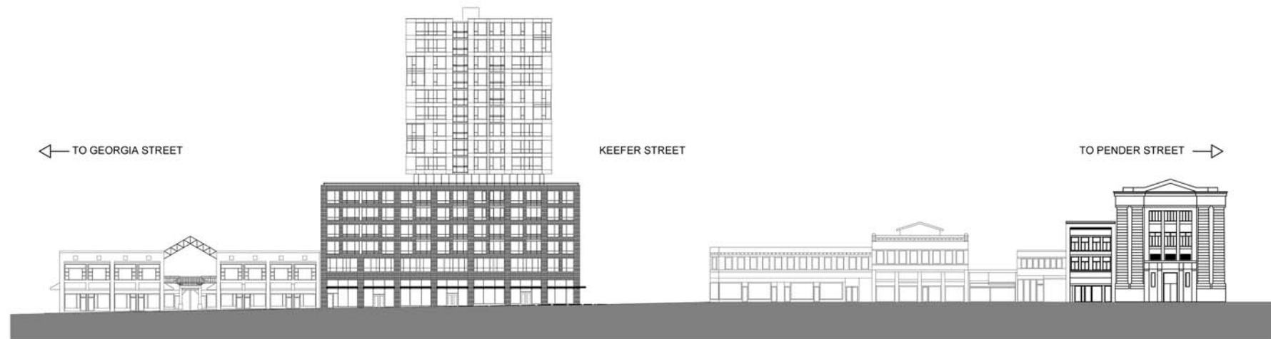
← TO GEORGIA STREET KEEFER STREET TO PENDER STREET →