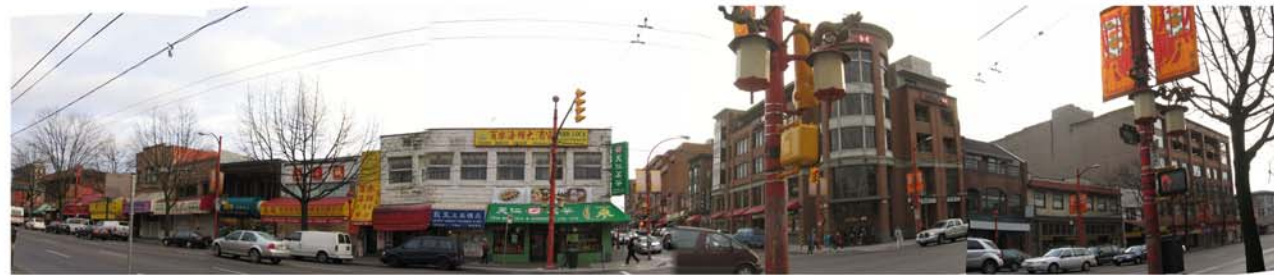
TO PENDER STREET KEEFER STREET TO GEORGIA STREET MAIN STREET LOOKING EAST