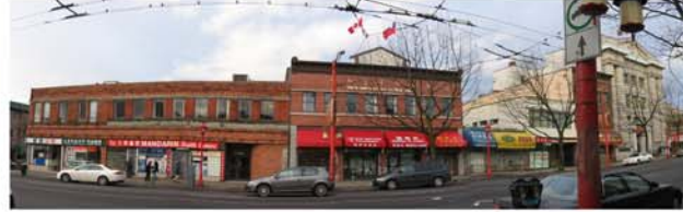
TO PENDER STREET MAIN STREET LOOKING WEST