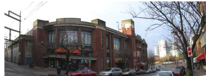
KEEFER STREET, CHINATOWN PLAZA