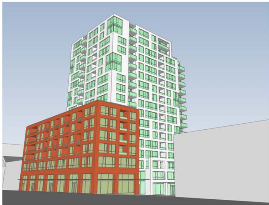
MAIN STREET LOOKING SOUTH