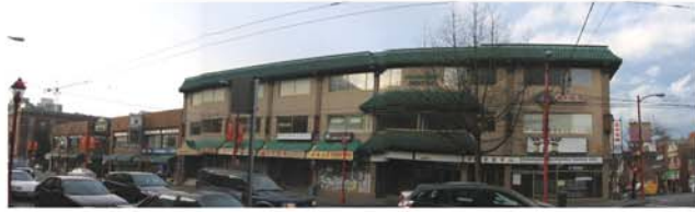
TO GEORGIA STREET ← SUBJECT SITE → KEEFER STREET