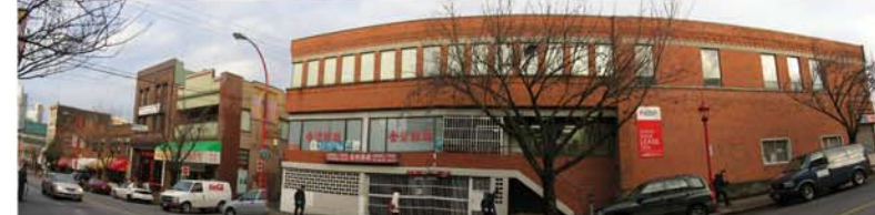
KEEFER STREET LOOKING NORTH