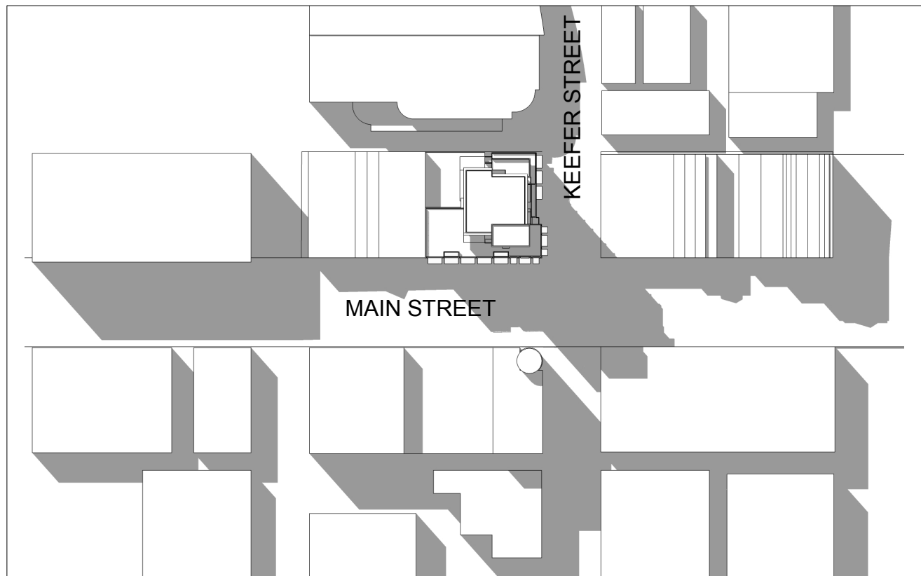
MARCH 21 & SEPTEMBER 21 3.00 PM