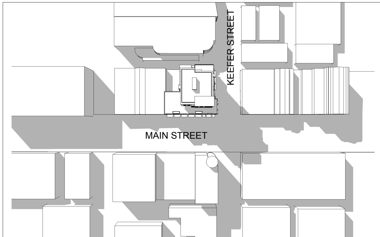
MARCH 21 & SEPTEMBER 21 3.00 PM