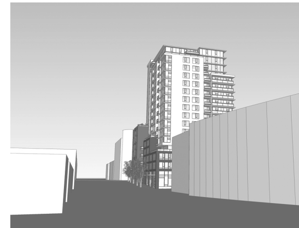
KEEFER STREET LOOKING EAST