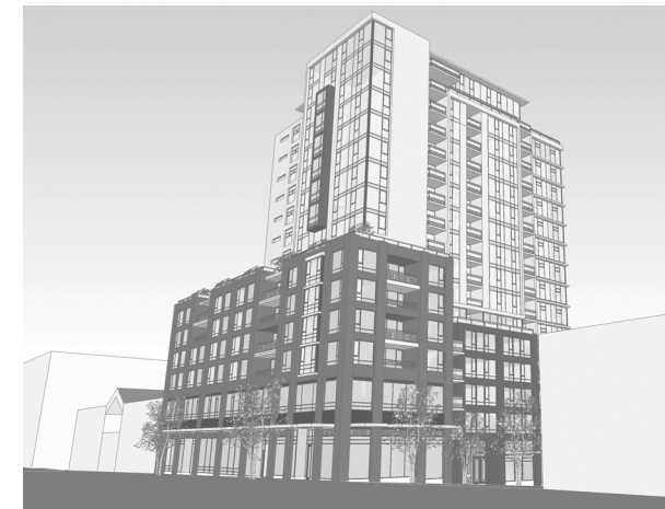
MAIN STREET LOOKING SOUTH