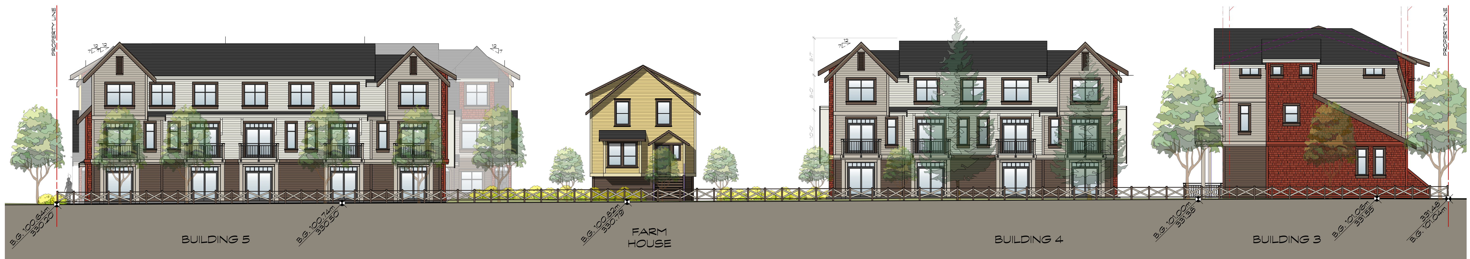
2 STREET ELEVATIONS ALONG GREEN WAY A5.1 SCALE: 1/8" = 1'-0"

PROJECT: AVALON RESIDENTIAL 5805 WALES ST. VANCOUVER, B.C.