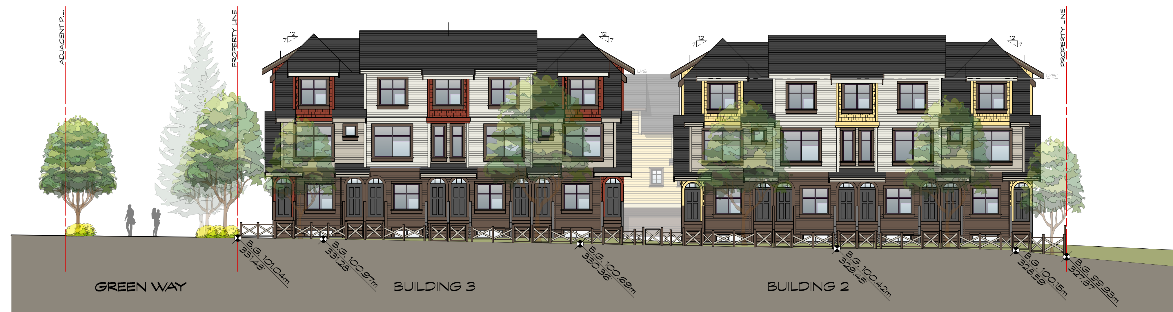
1 STREET ELEVATIONS ALONG WALES STREET A5.1 SCALE: 1/8" = 1'-0"

Robert Ciccozzi Architecture Inc. 200 - 2339 Columbia Street Vancouver, B.C. Canada V5Y 3Y3 Tel: (604) 687-4741 Fax: (604) 687-4641 admin@ciccozziarchitecture.com