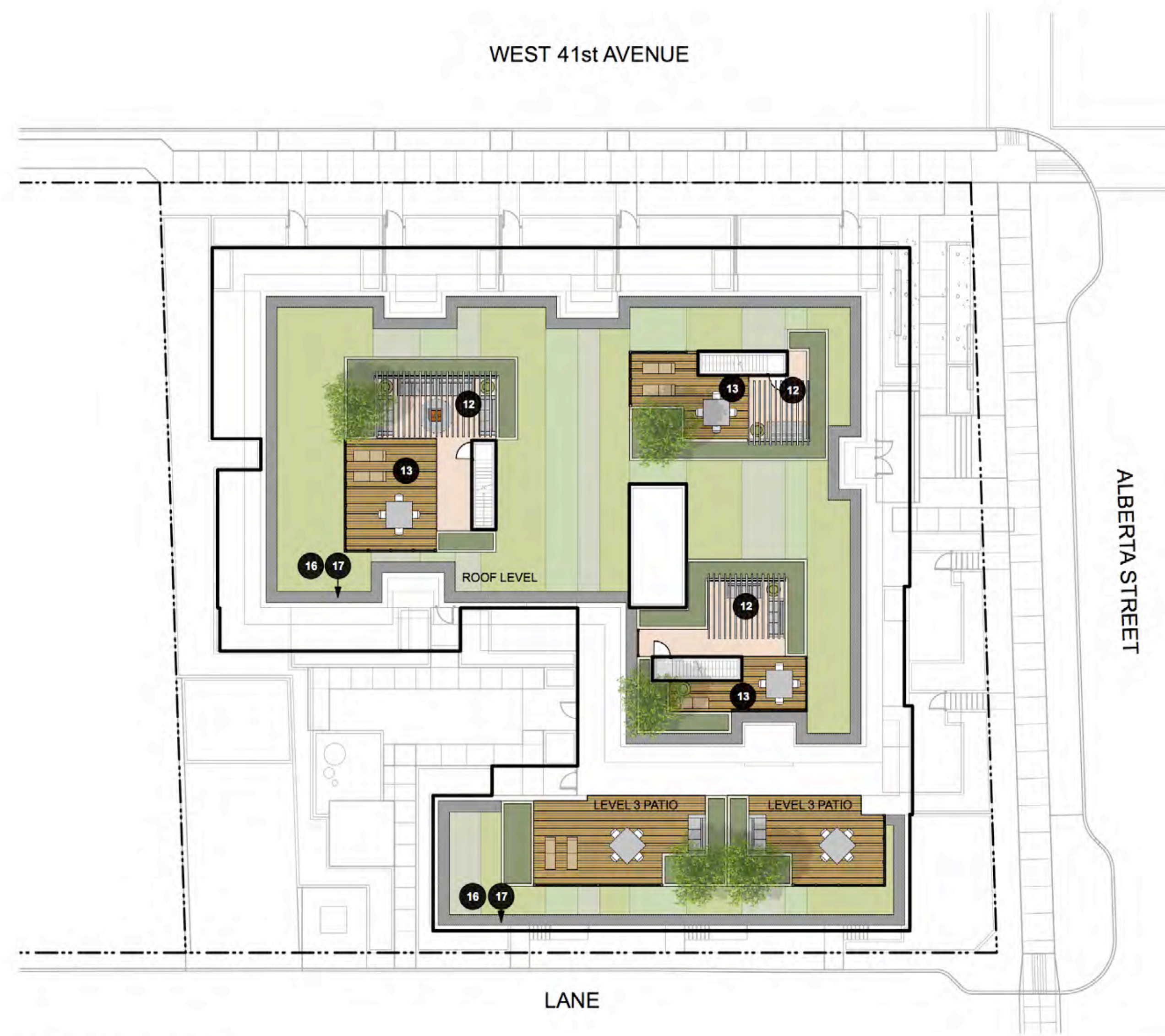
3 ROOF LEVEL LANDSCAPE PLAN