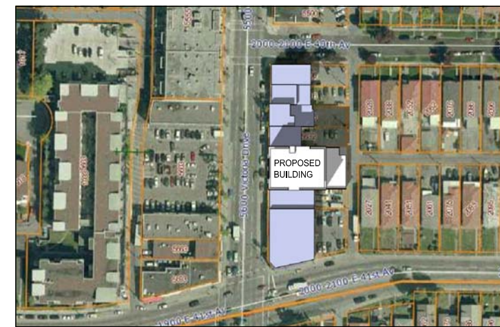
02:00 PM MARCH 21st