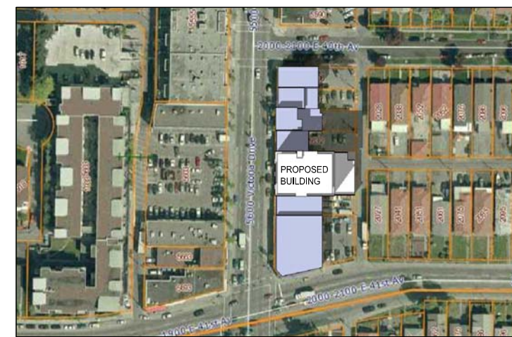
02:00 PM SEPT. 21st