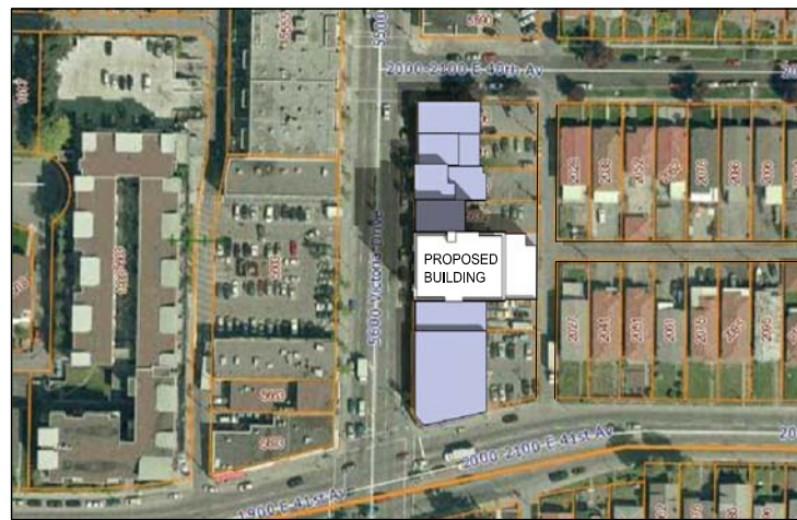
10:00 AM MARCH 21st

Revision Date: Dwg. No. NOV 10, 2012 D02