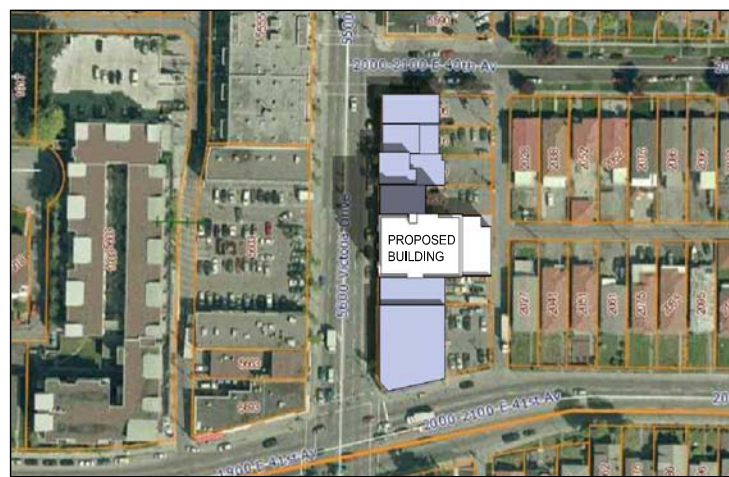
10:00 AM SEPT. 21st