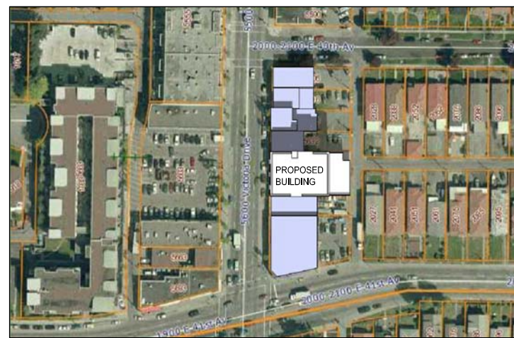
NOON SEPT. 21st