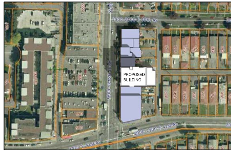
10:00 AM MARCH 21st

Revision Date: Dwg. No. May 22, 2012 D02