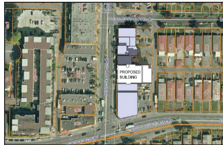
NOON MARCH 21st