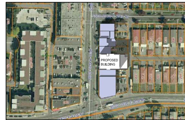
02:00 PM SEPT. 21st