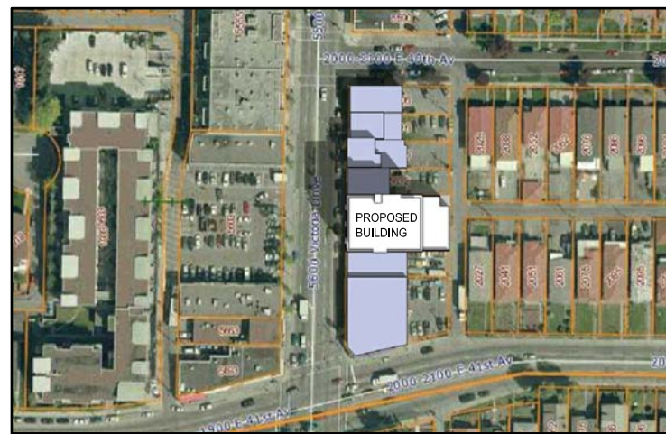
10:00 AM SEPT. 21st