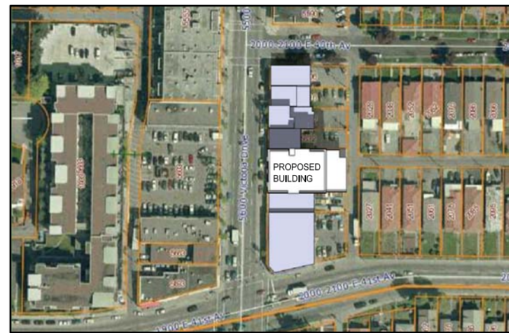
NOON SEPT. 21st