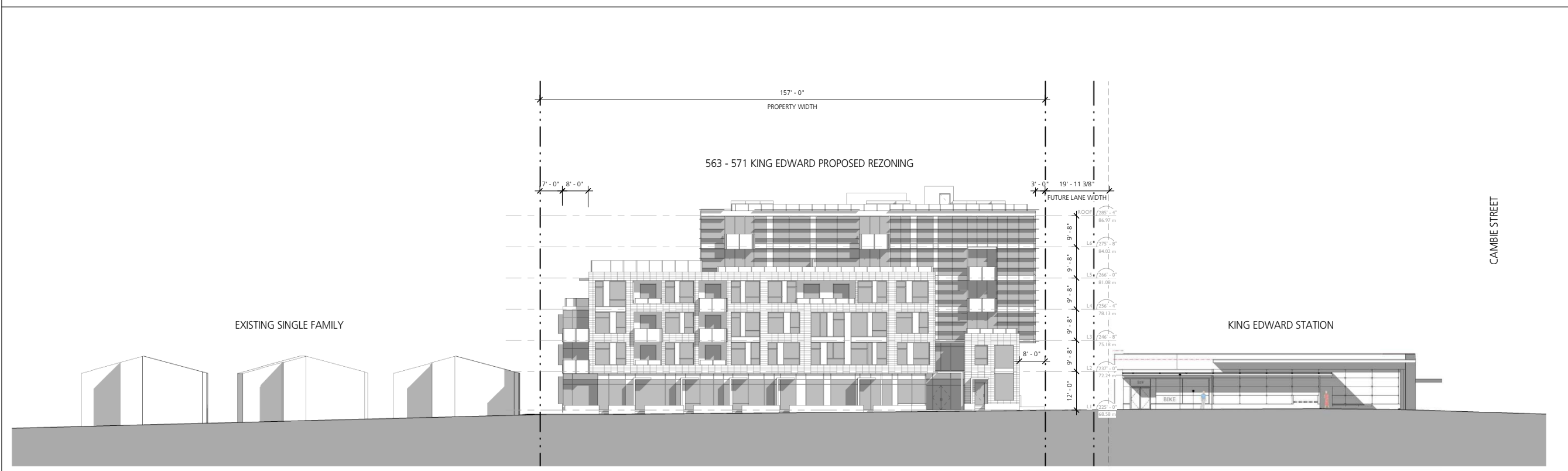
2 CURRENT STREET ELEVATION - KING EDWARD 1/16" = 1'-0"