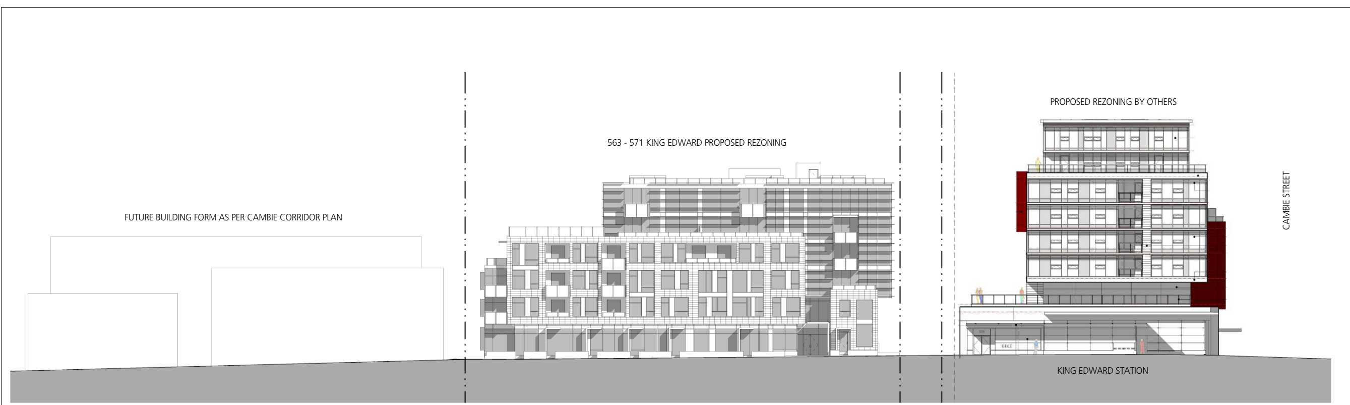
1 FUTURE STREET ELEVATION - KING EDWARD 1/16" = 1'-0"