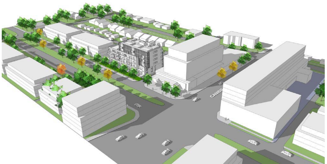
PROPOSED CONTEXT MASSING