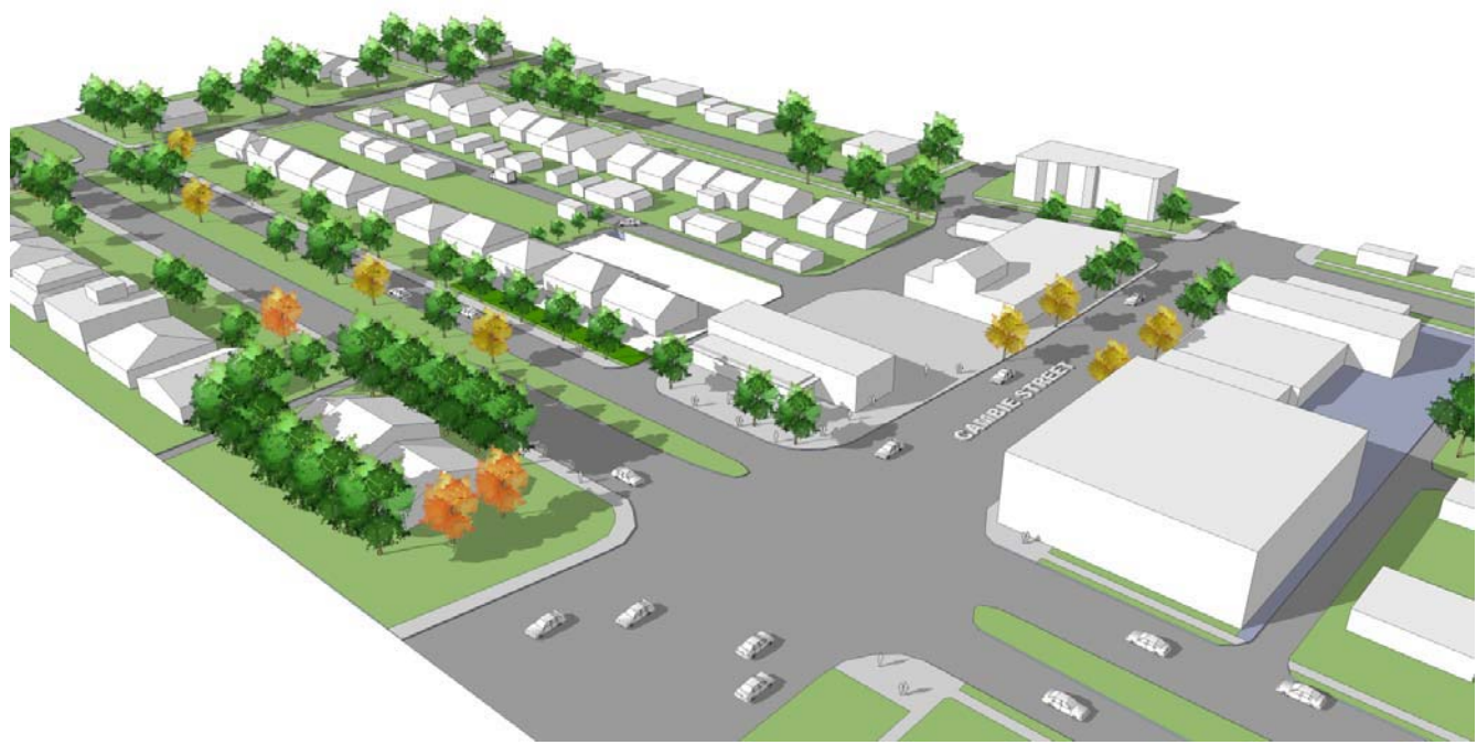
EXISTING CONTEXT MASSING