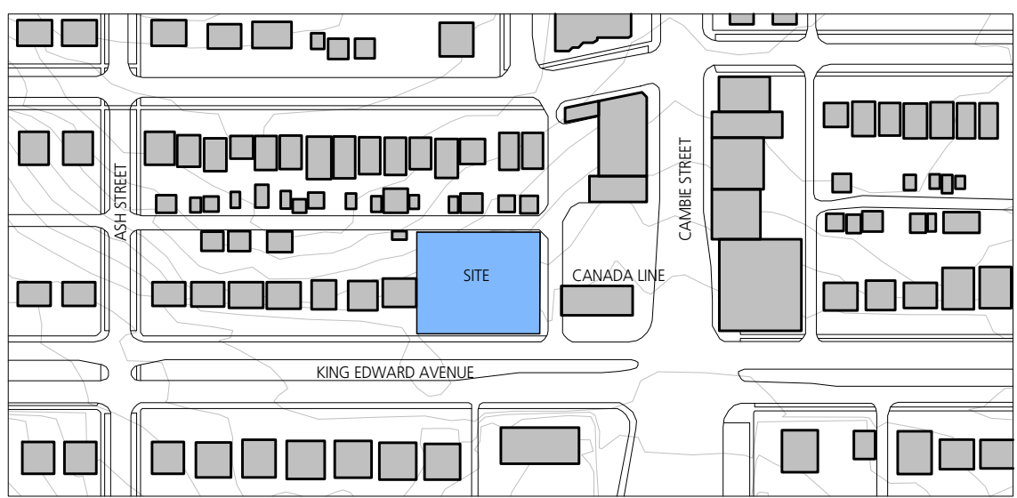
CONTEXT PLAN: 1" = 100'