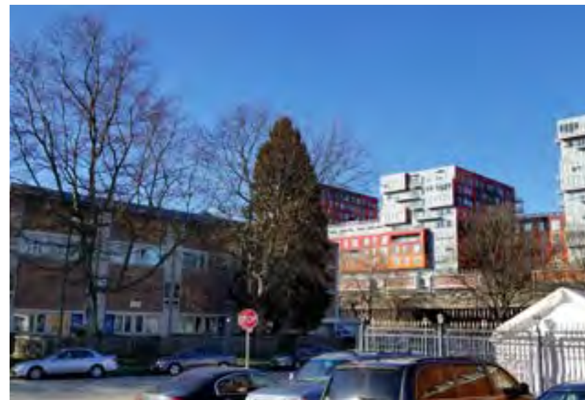
View from site across Raymur Ave., viewing northwest