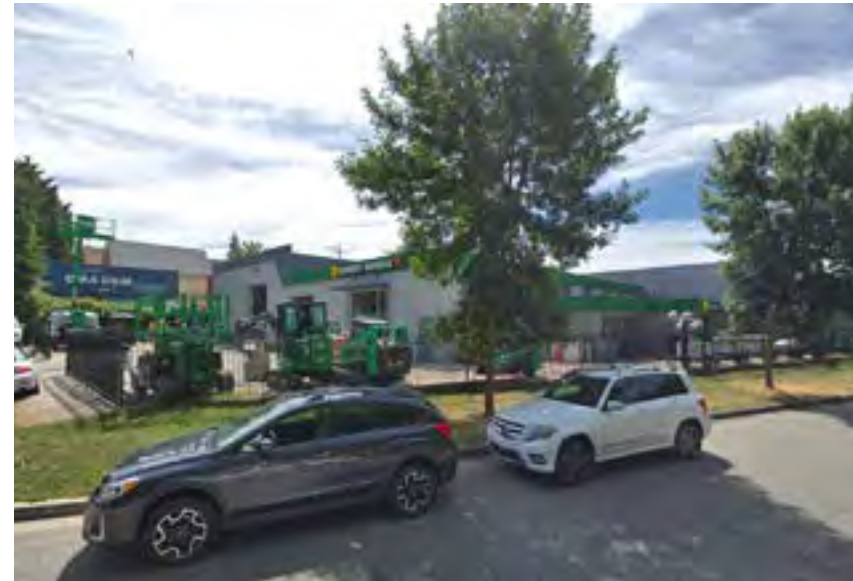
View of site north of subject site