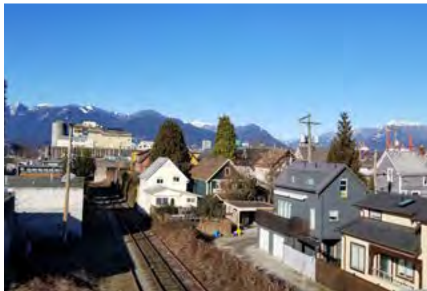
View north from pedestrian overpass