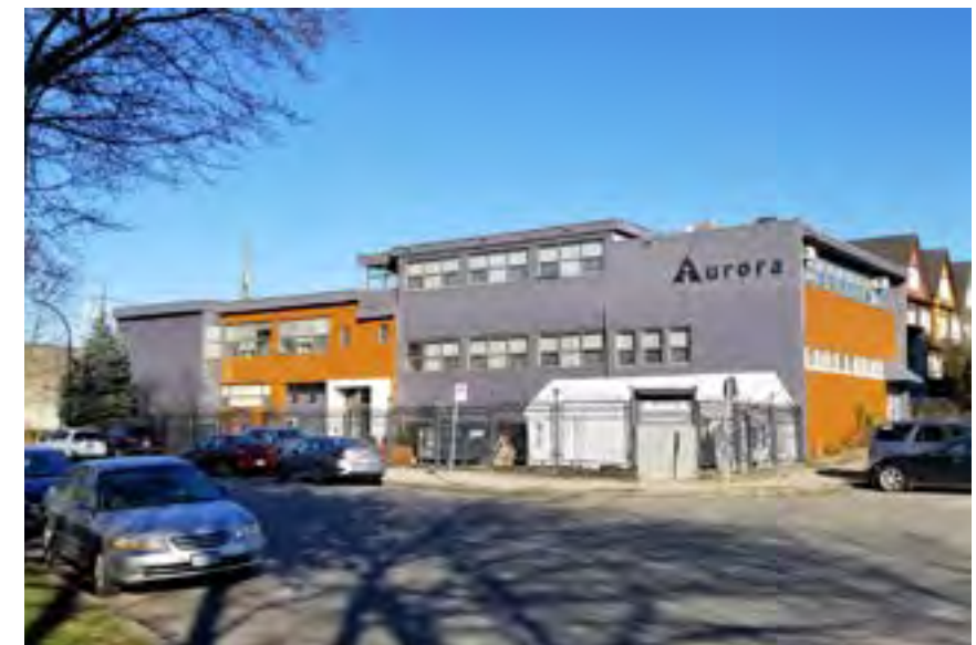
View of lot at Raymur Avenue and Pender Street