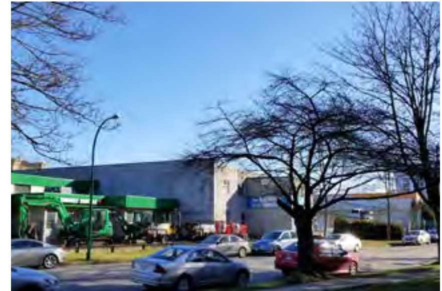
Viewing south east down Raymur Avenue towards site