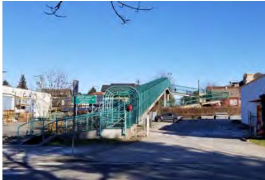
Pedestrian Overpass on Raymur Avenue south of site