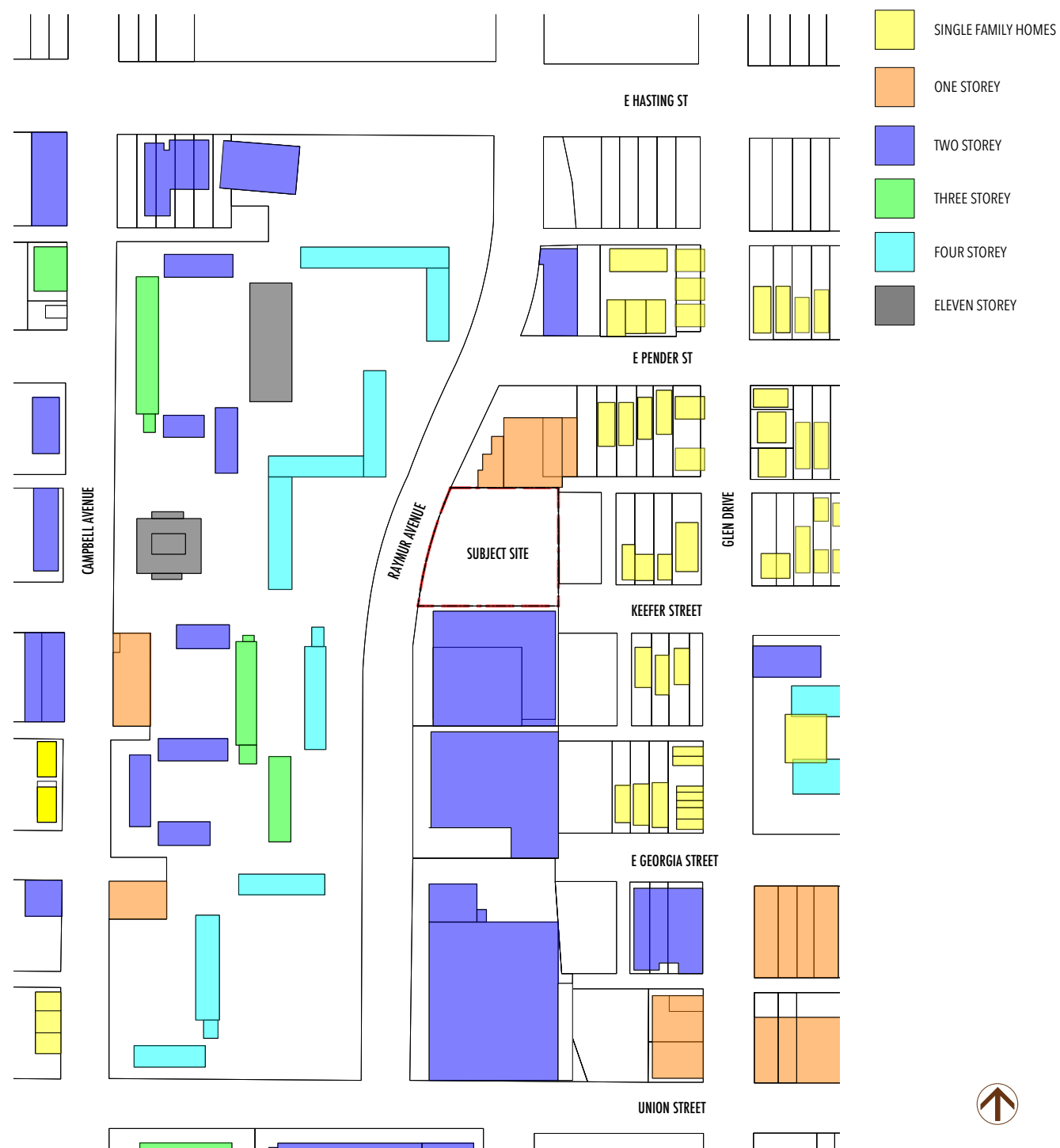
Context Plan - Building Heights