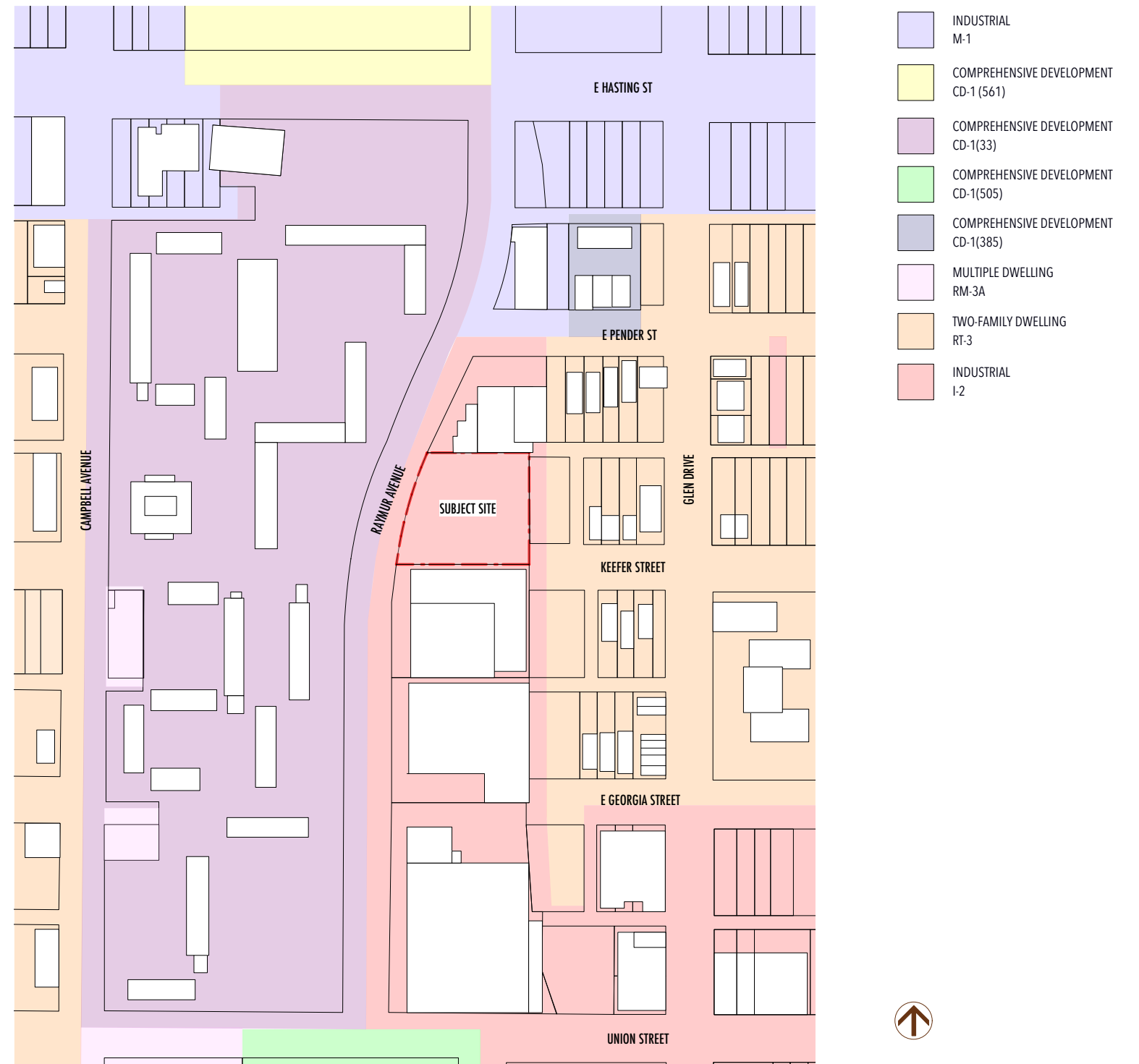
Context Plan - Zoning