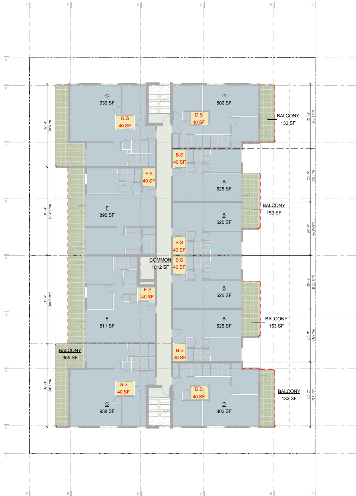
① Level 2 - FSR Plan 3/32" = 1'-0"