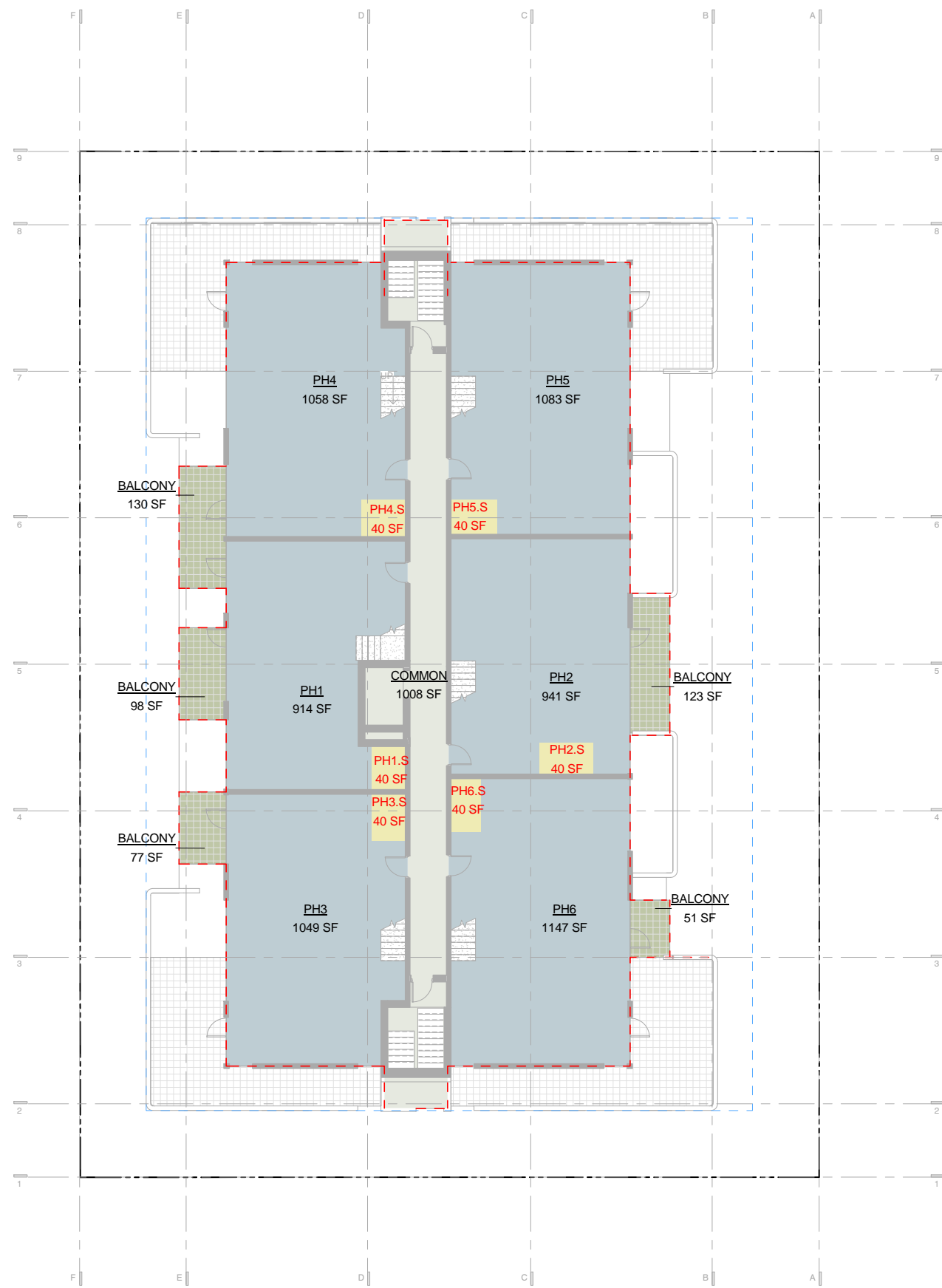
① Level 4 - FSR Plan 3/32" = 1'-0"