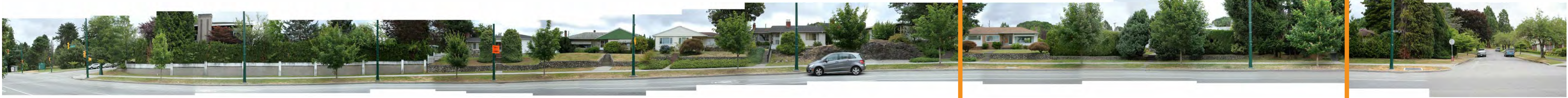
VIEW ALONG CAMBIE STREET