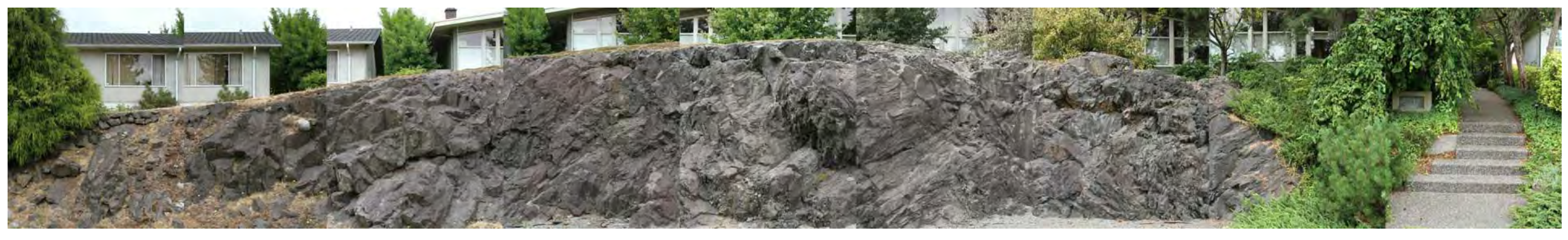
ROCK OUTCROPPING AT THE WONG RESIDENCE