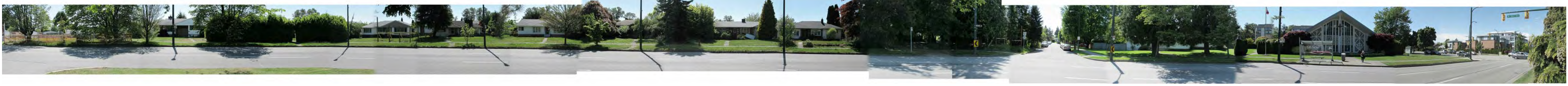
VIEW ACROSS CAMBIE STREET