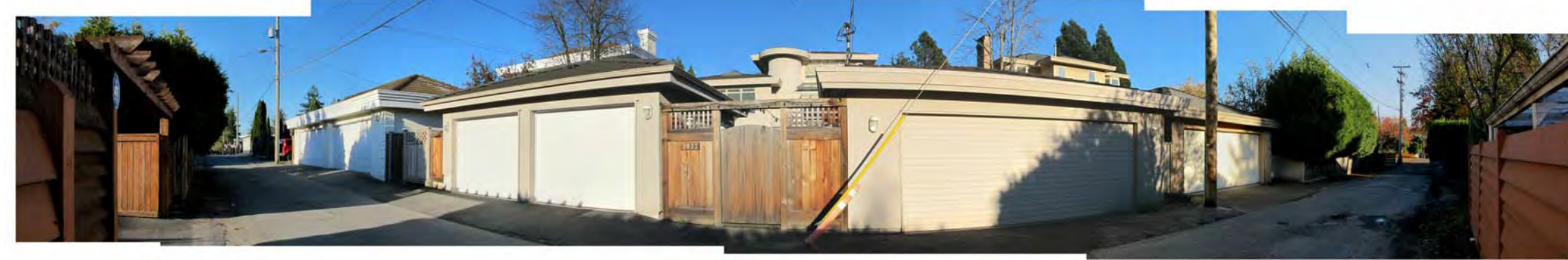
VIEW AT LANE FROM SITE