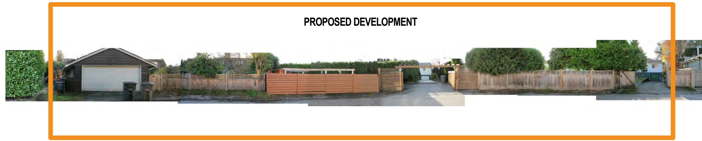
VIEW ALONG LANE