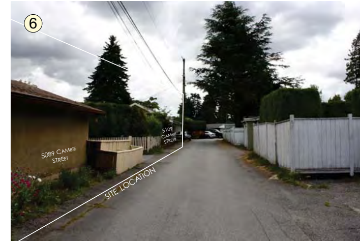
LANE ALONG SITE