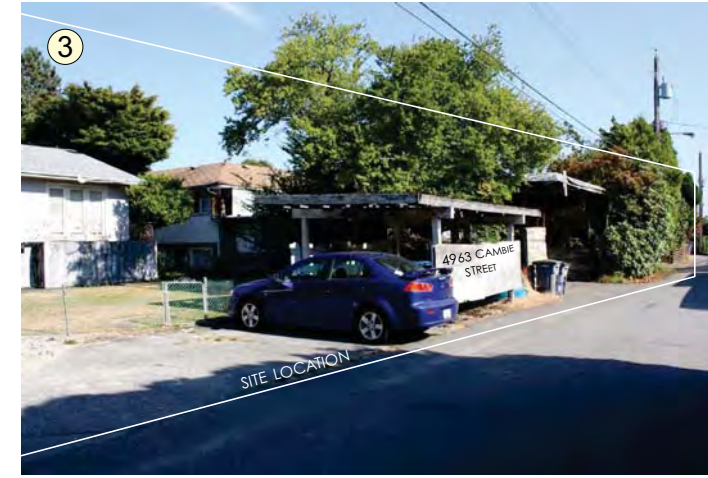
LANE ALONG SITE