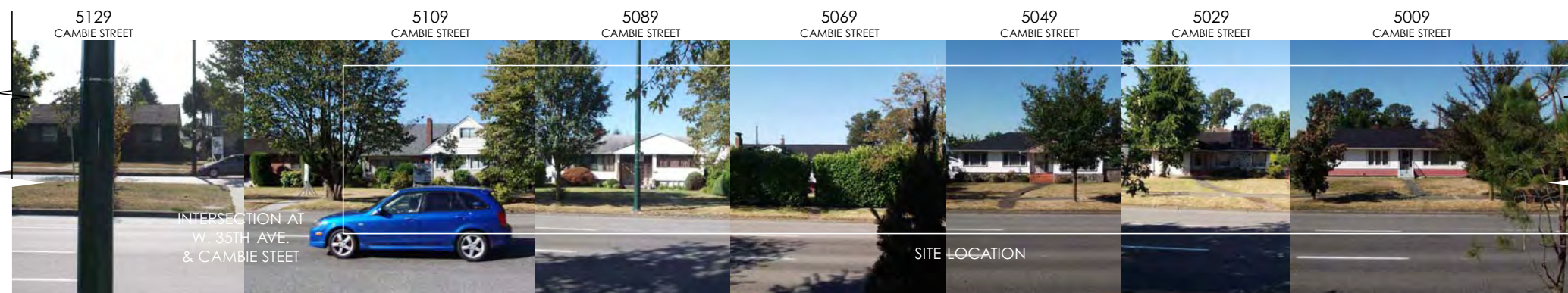
CAMBIE STREETScape (CONT.)