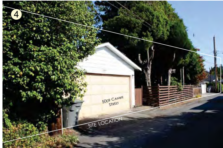
LANE ALONG SITE