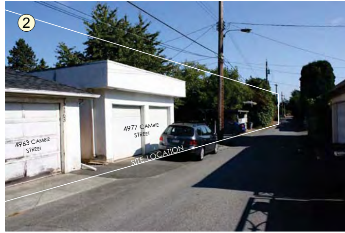
LANE ALONG SITE