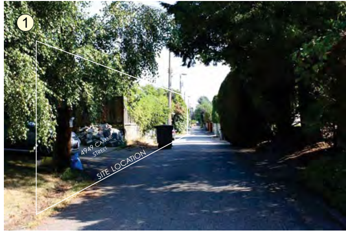
LANE ENTRY FROM MCGUIGAN DR.

REVISIONS ISSUED FOR REZONING JUNE, 2012 RE-ISSUED FOR REZONING JUNE, 2012