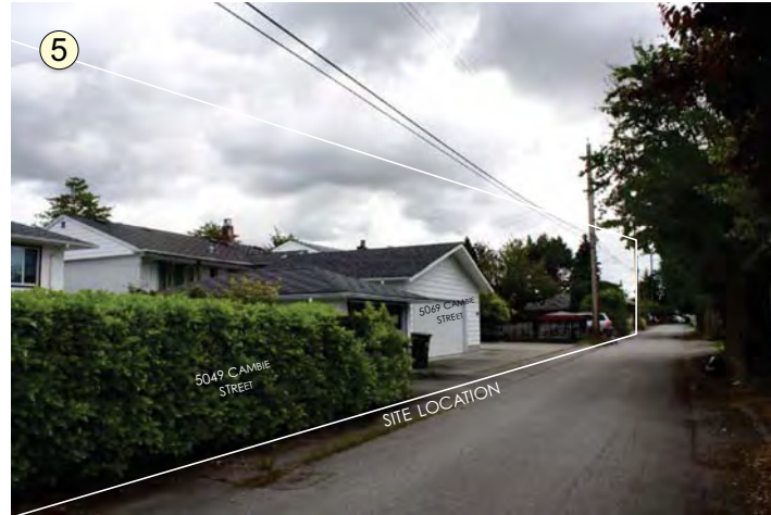
LANE ALONG SITE