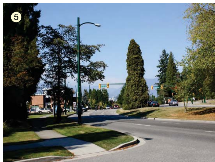
CAMBIE AND 33RD AVENUE INTERSECTION