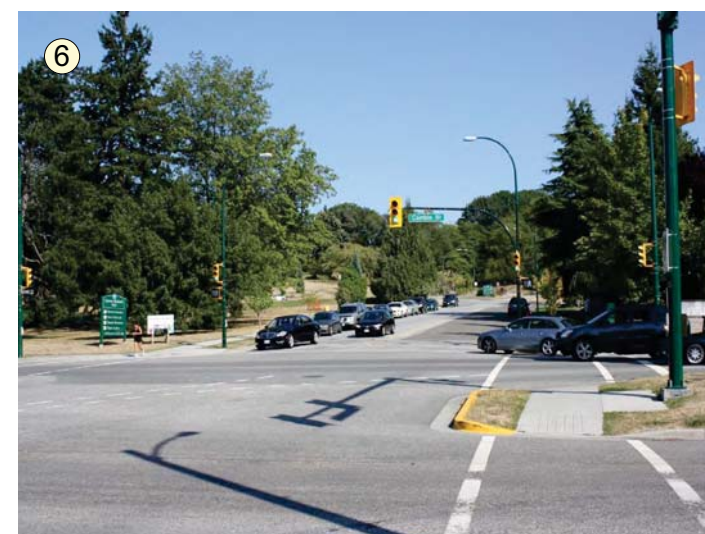
ENTRANCE TO QUEEN ELIZABETH PARK ON 33RD AVE.