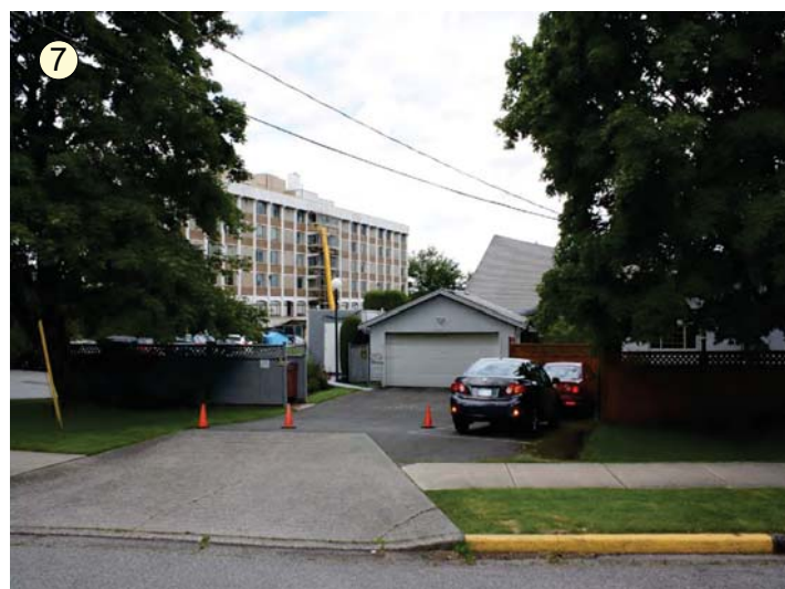
LOOKING NORTH FROM LANE ENTRY ON MCGUIGAN DR.