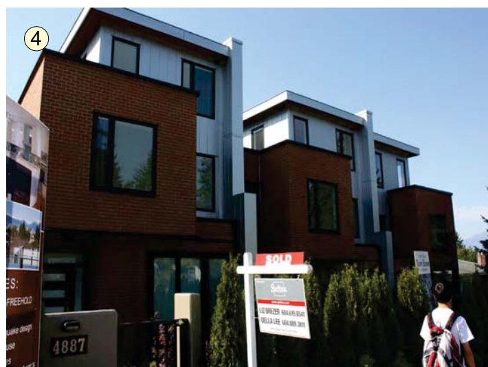
NEW DEVELOPMENT ON THE NORTH WEST CORNER OF CAMBIE AND 33RD AVE.