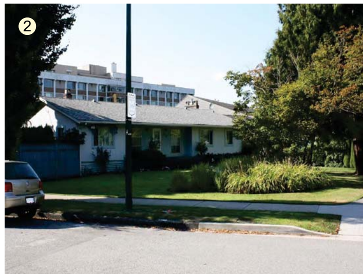
RESIDENCE ATTACHED TO HOLY NAME PERISH CHURCH