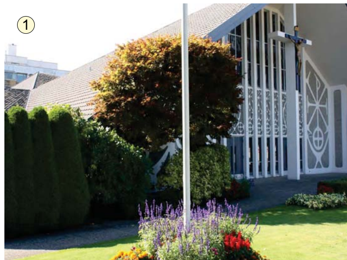
HOLY NAME PERISH CHURCH