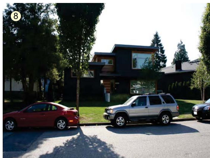
4989 ASH STREET