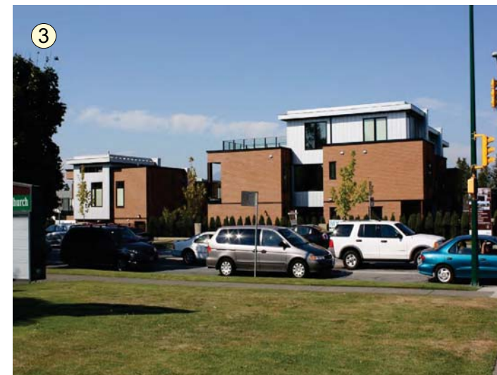
NEW DEVELOPMENT ON THE NORTH WEST CORNER OF CAMBIE AND 33RD AVE.