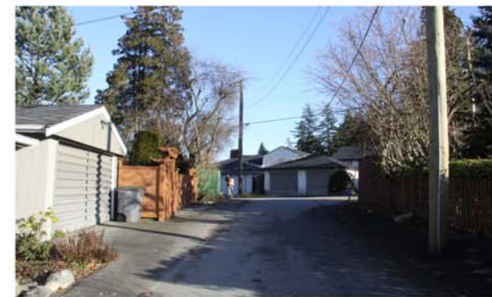
Existing laneway looking towards site