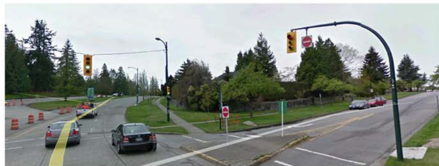
Corner of 29th Ave and Cambie St.