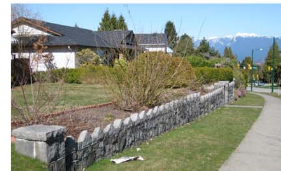
Existing front yard with landscaping walls