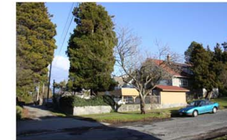
30th Ave - Retaining wall