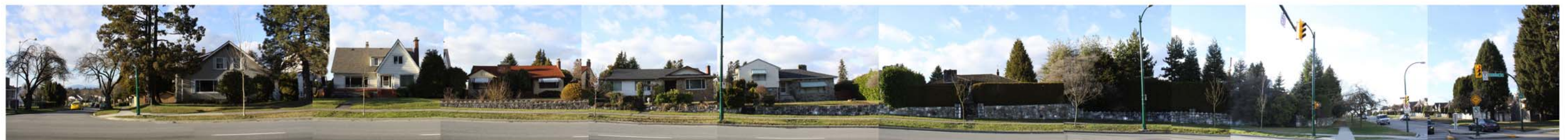
Existing Homes - Note: Rock wall runs along 6 of the 7 existing homes