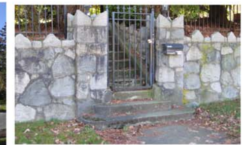
Existing Retaining Wall