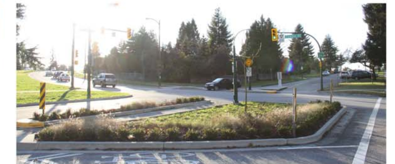
Bike lane @ 29th Ave. crossing Cambie St. boulevard