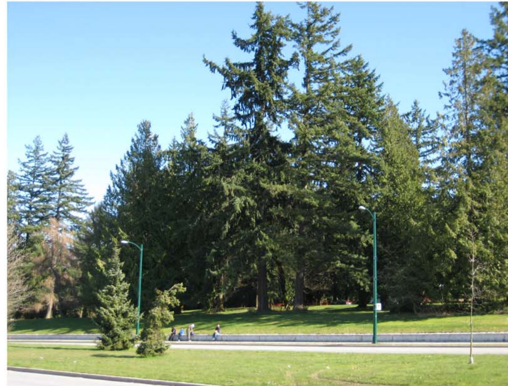
Queen Elizabeth Park across Cambie Street