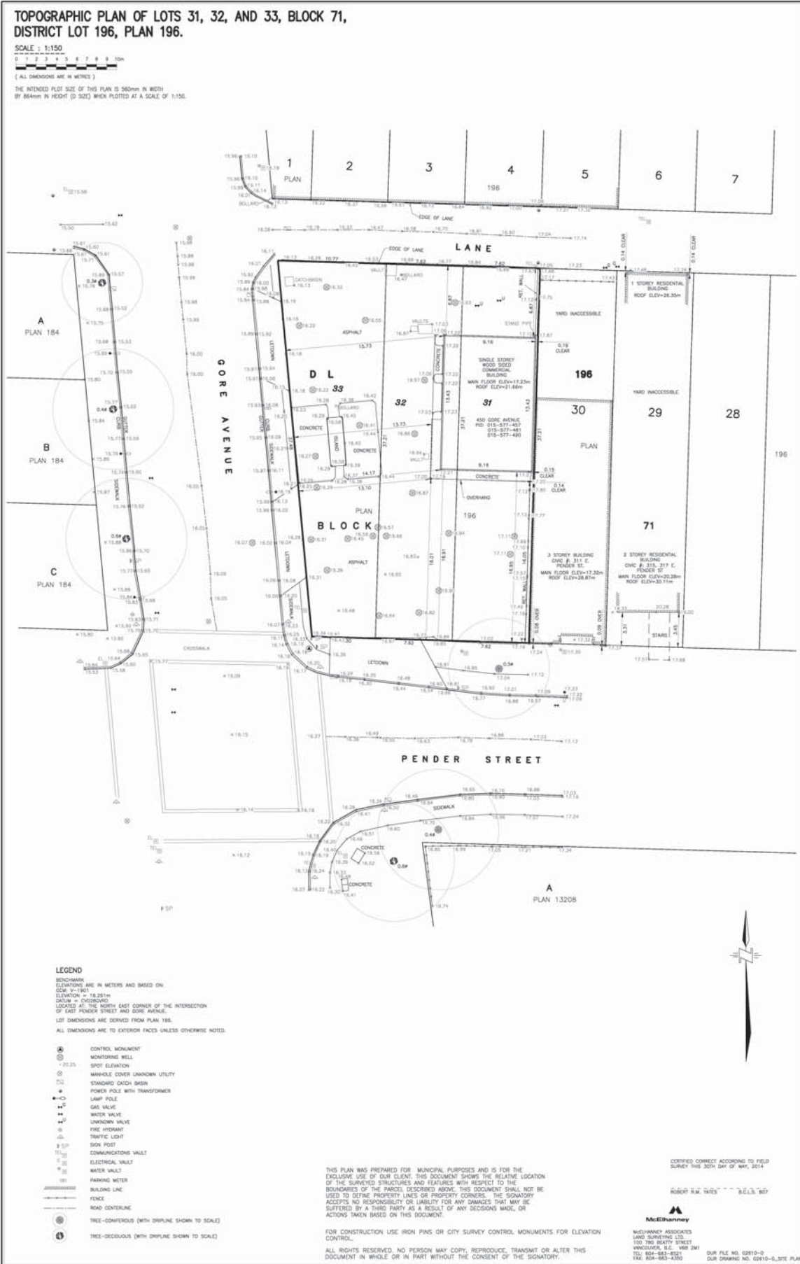
3 SURVEY 1" = 20'-0"