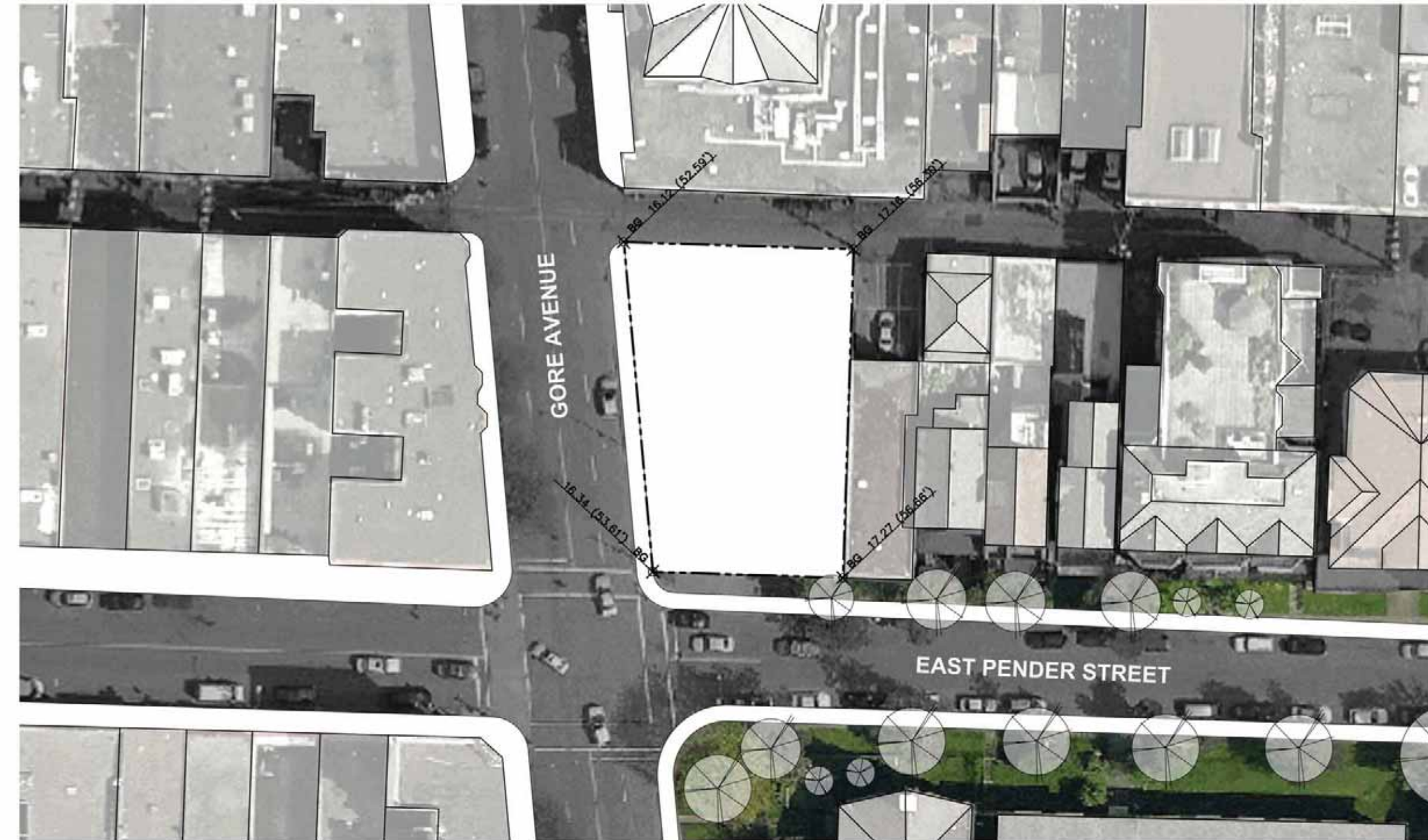
2 SITE PLAN NTS