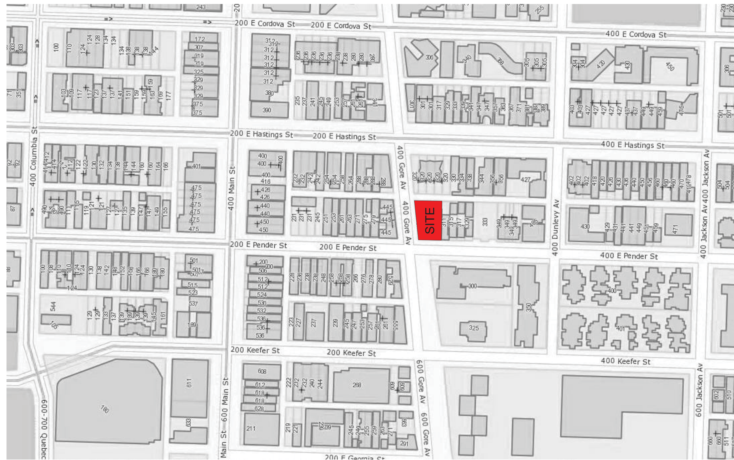
1 Context Plan 1 : 1750