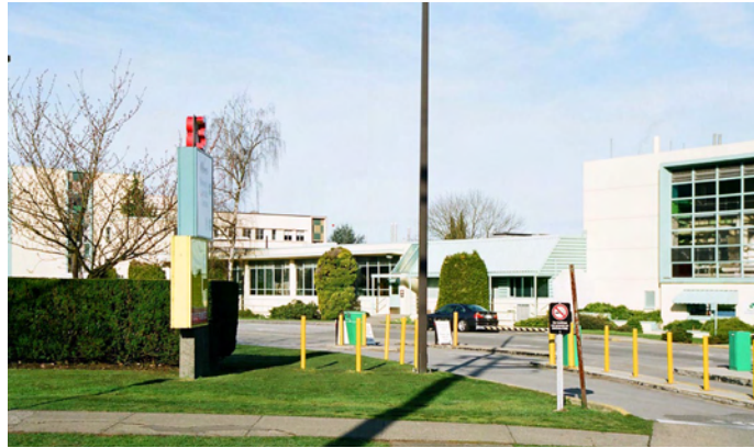
1 Heather Street at W 29th Ave - Existing