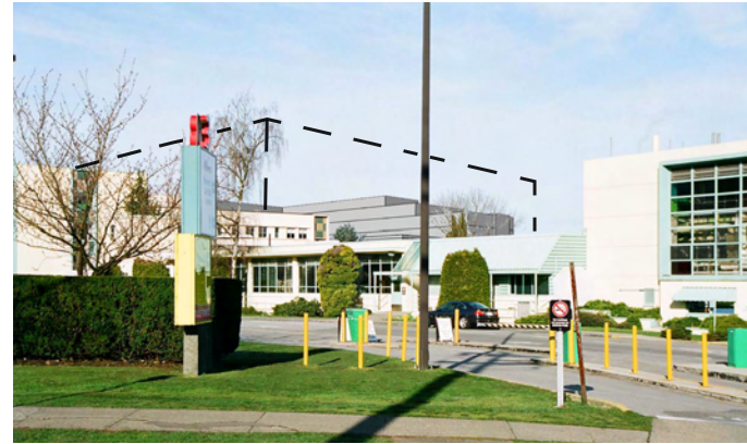
1 Heather Street at W 29th Ave - Proposed Rezoning