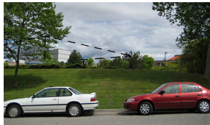
4 32nd Ave at Willow Street - Proposed Rezoning