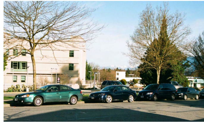
2 Heather Street at W 31st Ave - Proposed Rezoning