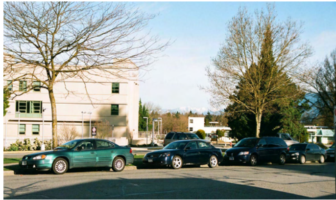
2 Heather Street at W 31st Ave - Existing