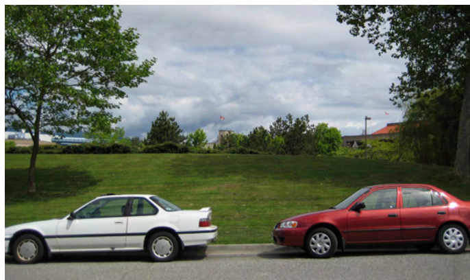
4 32nd Ave at Willow Street - Existing