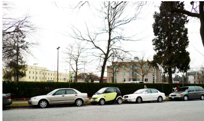
3 W 28th Ave - Existing