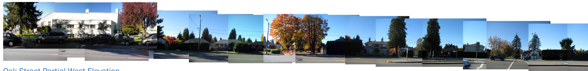
Oak Street Partial West Elevation