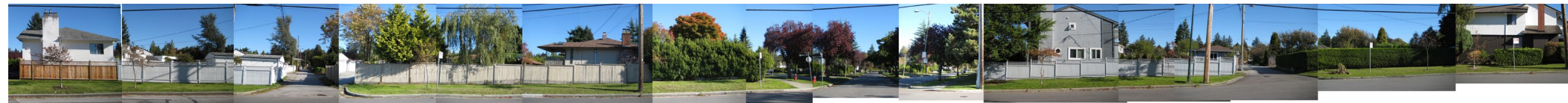
Heather Street Partial East Elevation

Where development along the edges occurs, the building forms and massing should respond to the scale of the residential neighbourhood. The existing berm along 32nd Avenue should be maintained where possible and landscaping should be of high quality.