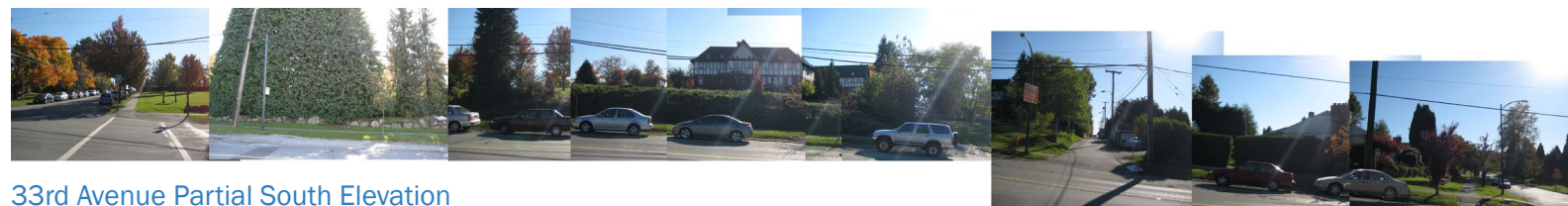
33rd Avenue Partial South Elevation