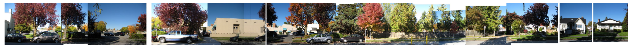
28th Street Partial North Elevation