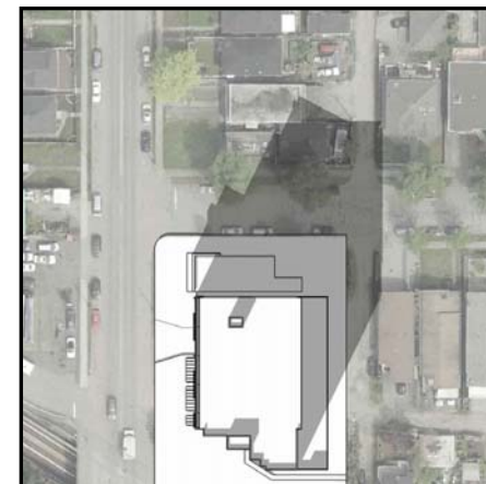
DECEMBER 21, 2:00 PM