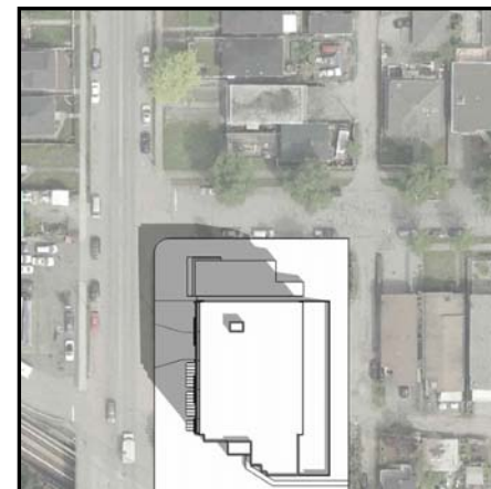
SEPTEMBER 21, 10:00 AM