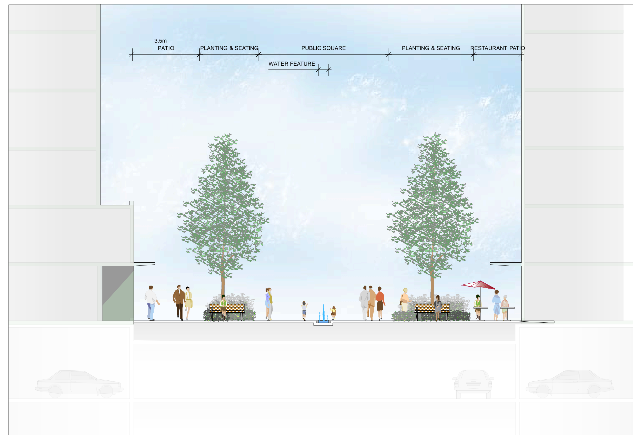
1 WEST PLAZA 1:100