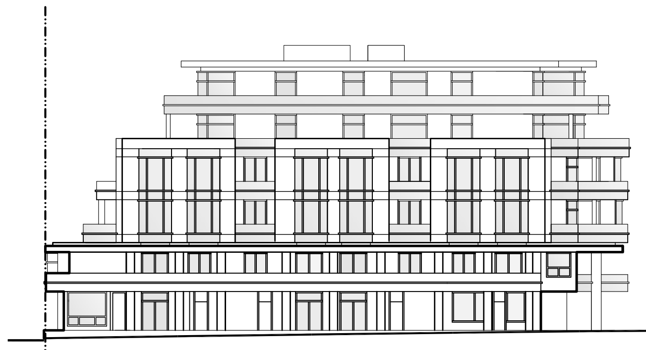
BUILDING 1 - SOUTH ELEVATION (OLD DESIGN)