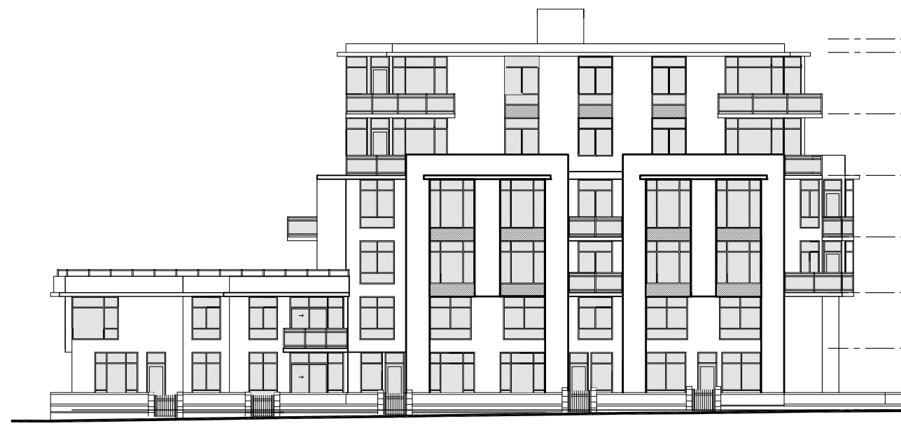
BUILDING 1 - SOUTH ELEVATION (NEW DESIGN)