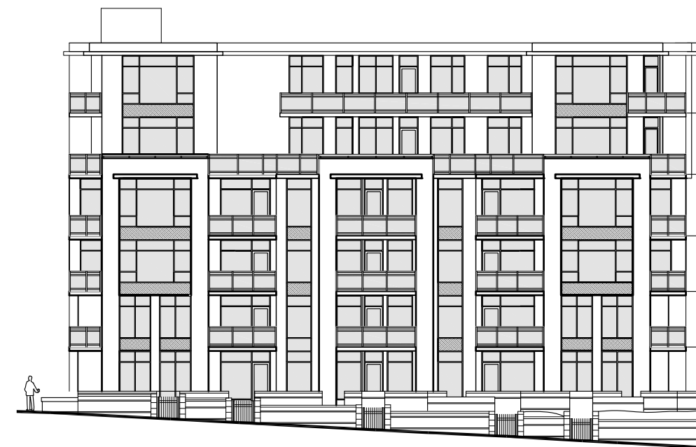
BUILDING 2 - EAST ELEVATION (NEW DESIGN)