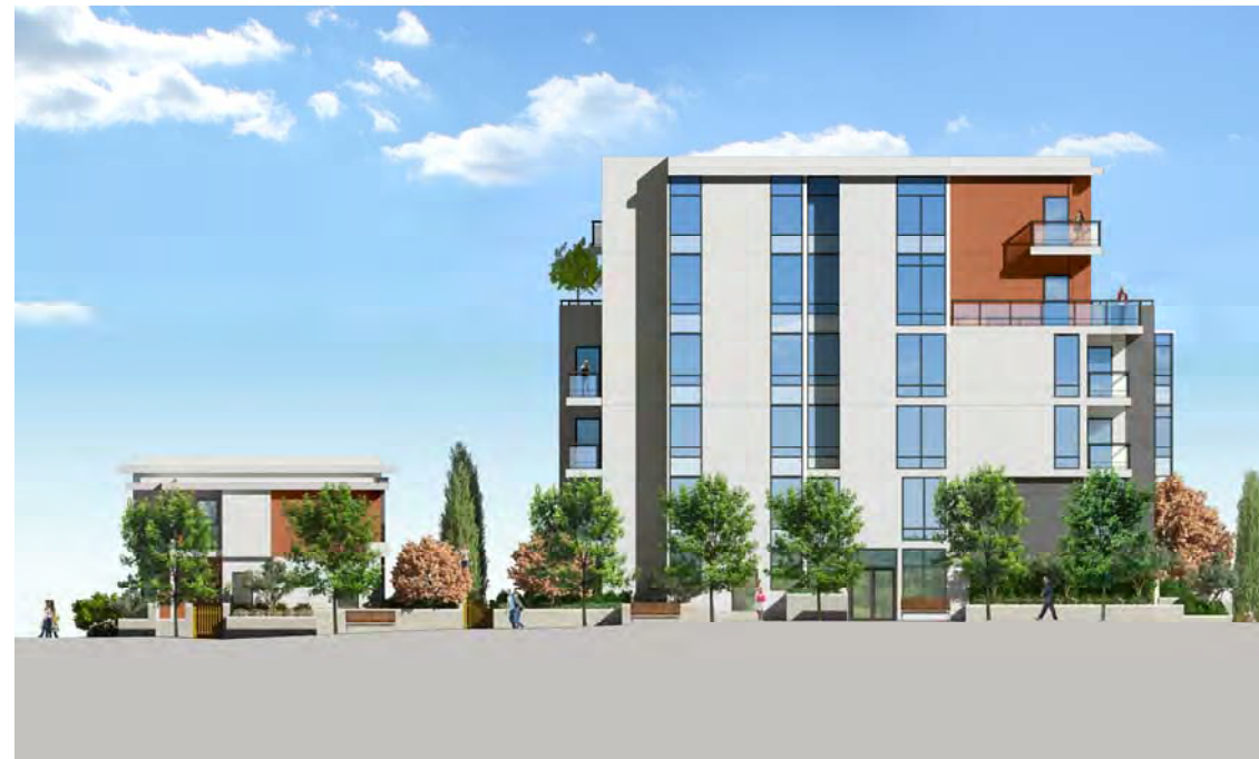
SOUTH ELVATION - BUILDING 3 AND 2