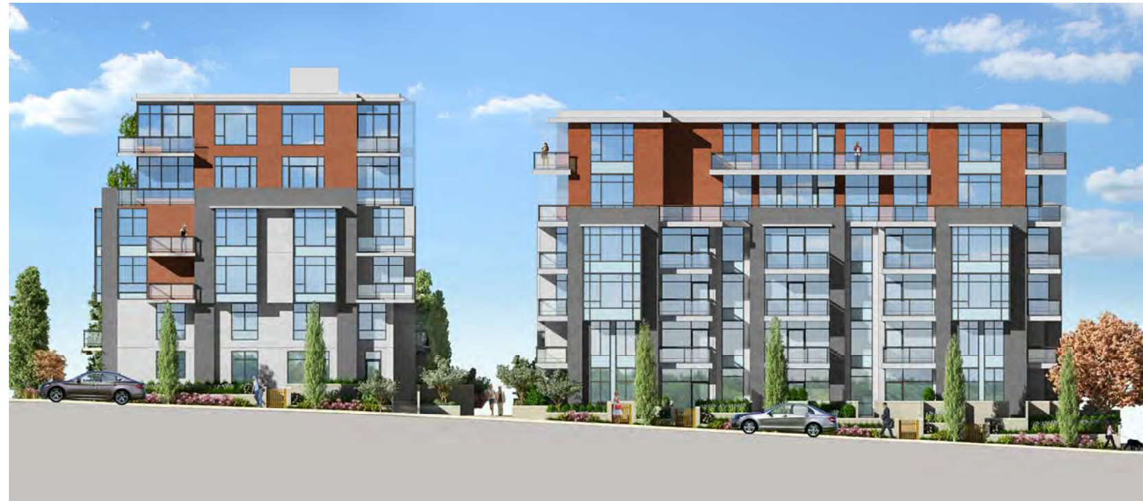
EAST ELVATION - BUILDING 1 AND 2