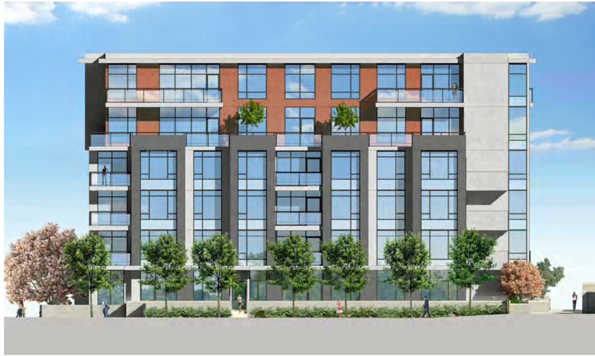
WEST ELVATION - BUILDING 2