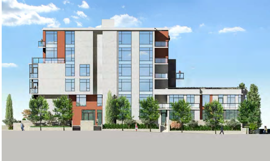
NORTH ELVATION - BUILDING 1