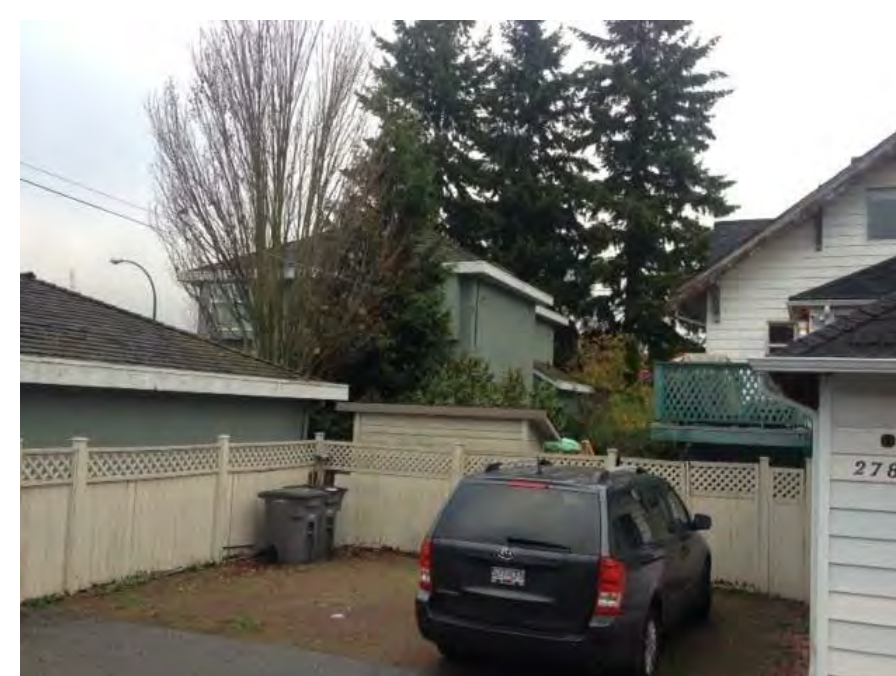
9 NORTH PROPERTIES - Across from rear lane

This drawing is an instrument of service and the property of Shift Architecture Inc. and shall remain their property. The use of this drawing shall be restricted to the original site for which it was prepared and publication thereof is expressly limited to such use. Reuse, reproduction or publication by any method in whole or in part is prohibited without their written consent.