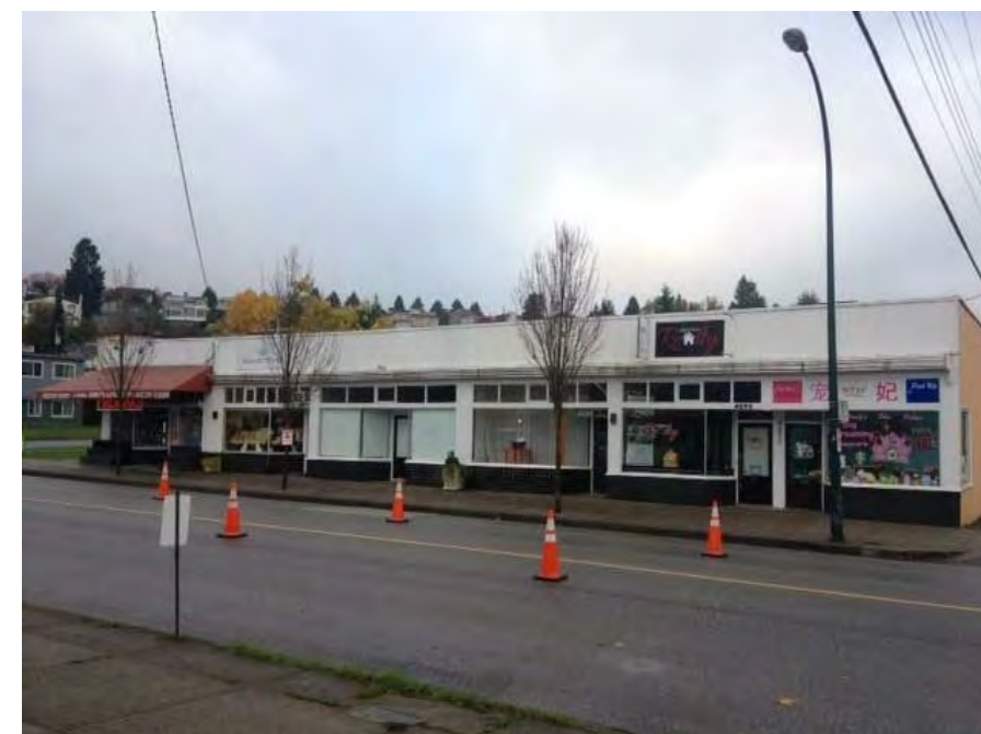
6 WEST ADJACENCY - Across Macdonald Street