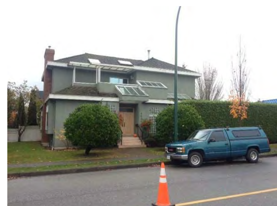
8 NORTH ADJACENCY - From Macdonald Street looking East