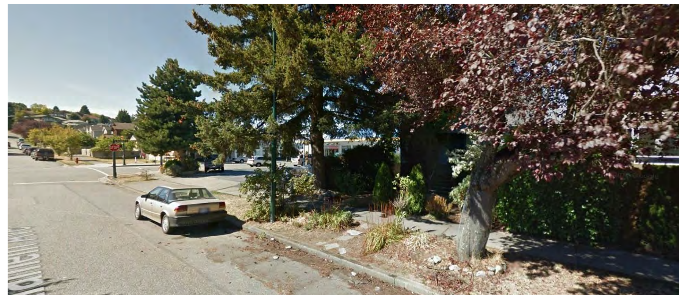
2 LOT 02 - 2785 Alamein Avenue