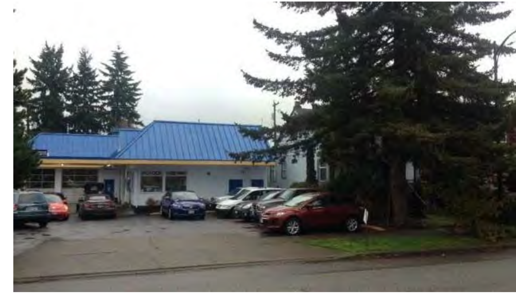
3 THE SITE - Lots 01 & 02 at Alamein Avenue