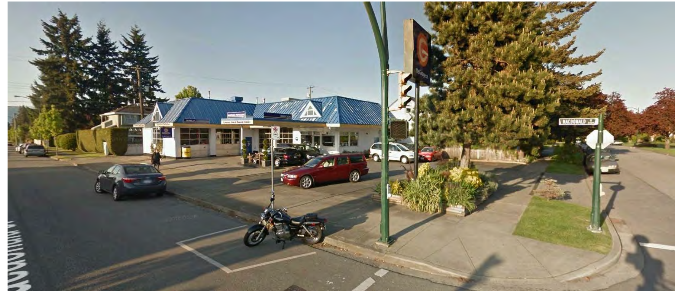
1 LOT 01 - 4066 Macdonald Street