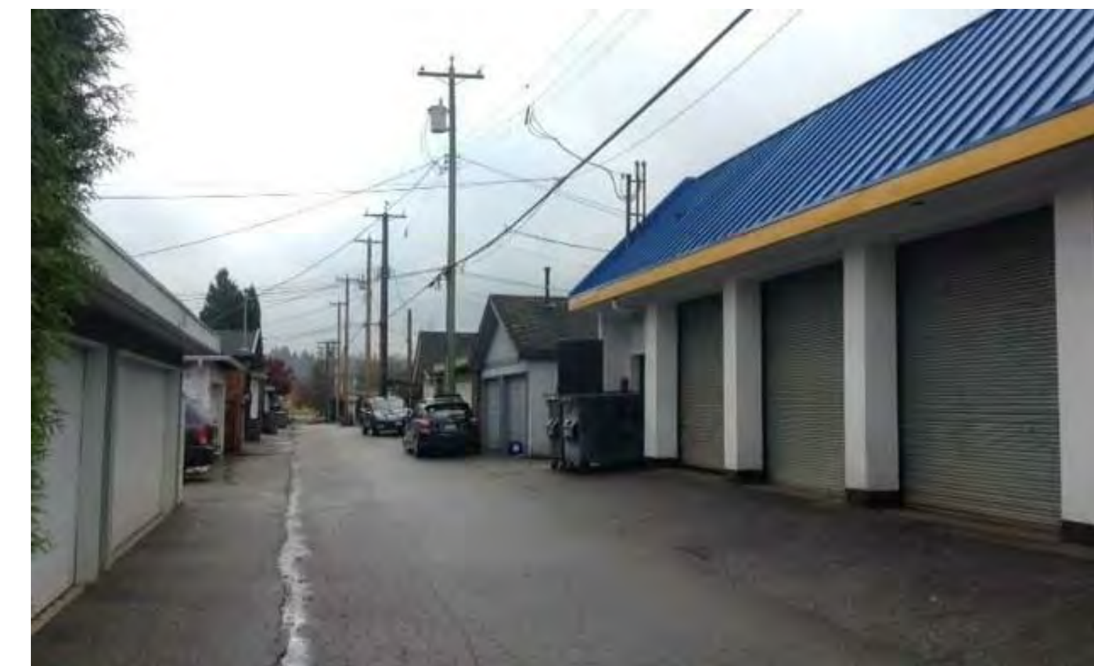
4 THE SITE - Lots 01 & 02 From rear lane looking Eastward