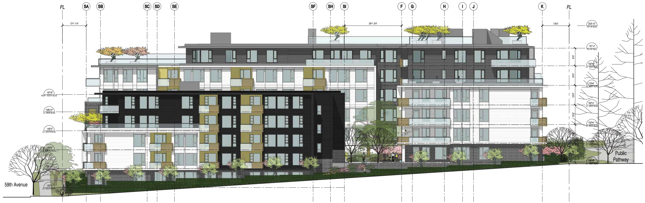
1 East Elevation DP 3.02 SCALE: 3/32" = 1'-0"