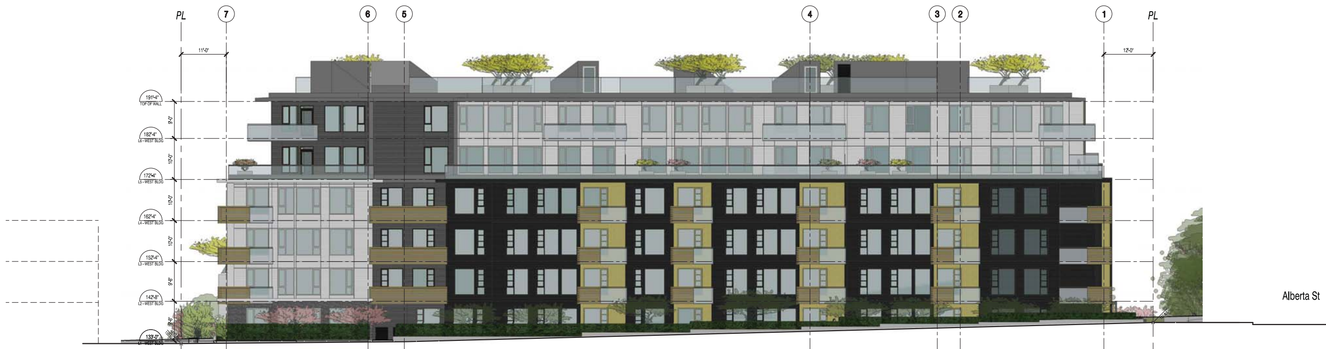
2 North Elevation (Facing Langara Golf Course) DP 3.01 SCALE 3/32" = 1'-0"