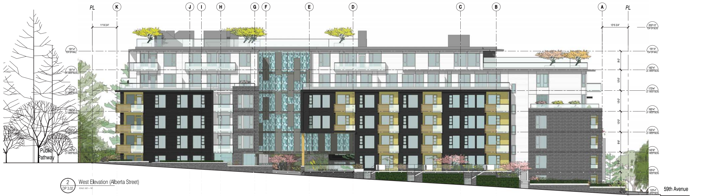
2 West Elevation (Alberta Street) DP 3.02 SCALE: 3/32" = 1'-0"