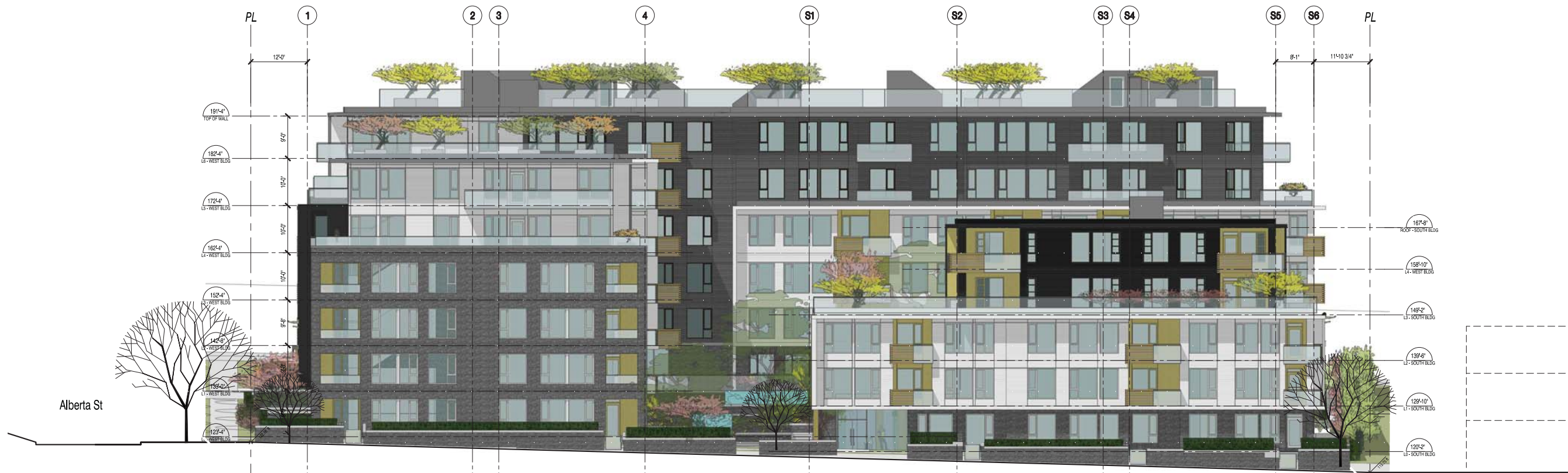
1 South Elevation (West 59th Avenue) DP 3.01 SCALE 3/32" = 1'-0"