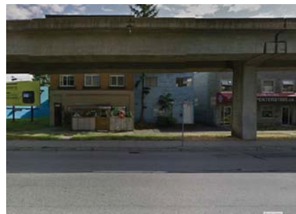
15) 1817 & 1819 VICTORIA DIVERSION