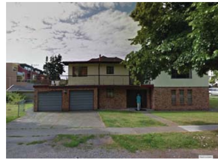
6) 1730 E18th Ave.