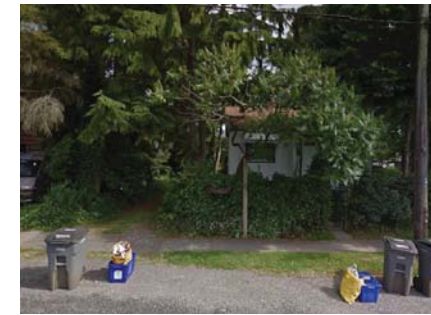
3) 1707 E18th Ave. - SUBJECT SITE