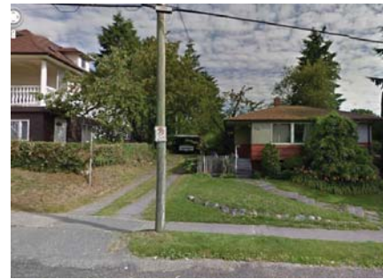
2) 1695 E18th Ave. - SUBJECT SITE