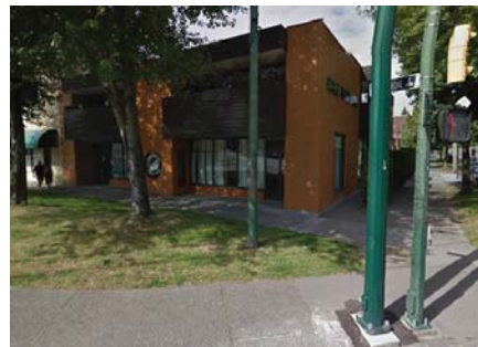
11) 3411 COMMERCIAL ST.