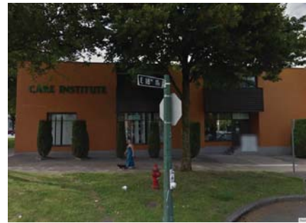
5) 3441 COMMERCIAL ST.