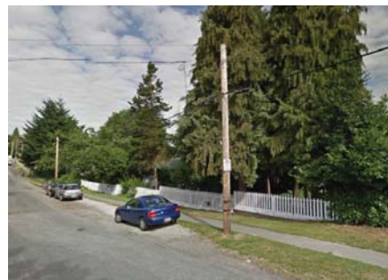
16) SE PERSPECTIVE OF SITE ON E18TH AVE.