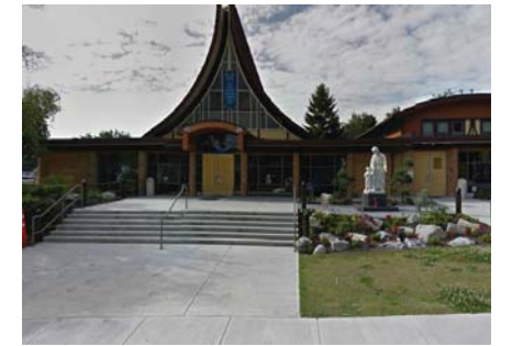
8) 1612 E18th Ave.