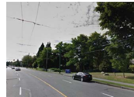
18) NE PERSPECTIVE OF SITE FROM COMMERCIAL DR.