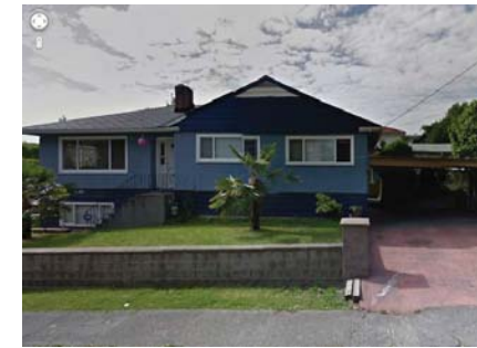
7) 1686 E18th Ave.