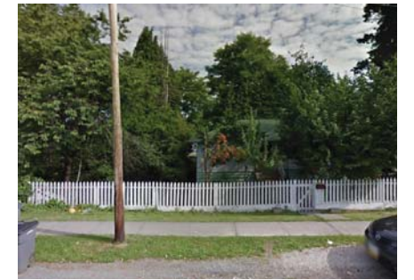
4) 1775 E18th Ave. - SUBJECT SITE