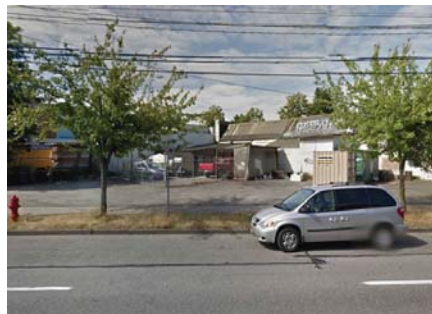
9) 3470 COMMERCIAL ST. (CURRENTLY UNDER DEV.)