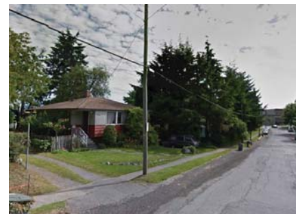
17) SW PERSPECTIVE OF SITE FROM E18TH AVE.