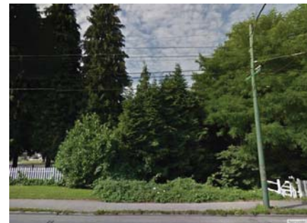
12) 1775 E18th Ave. - SUBJECT SITE