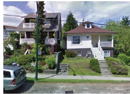
1) 1655 & 1685 E18th Ave.