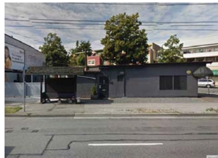
10) 3424 COMMERCIAL ST.