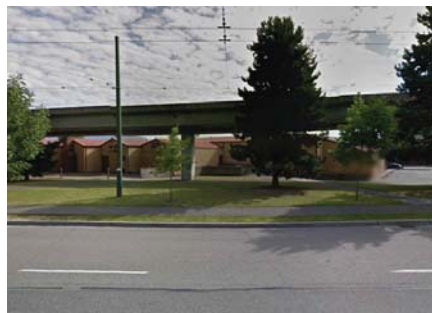
14) 3250 COMMERCIAL DR.