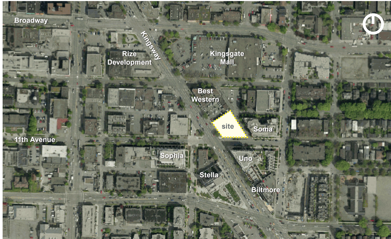
Fig. 7 location plan