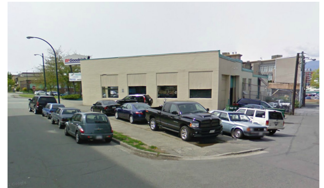
Fig. 10 view of site from E 11th Ave and lane