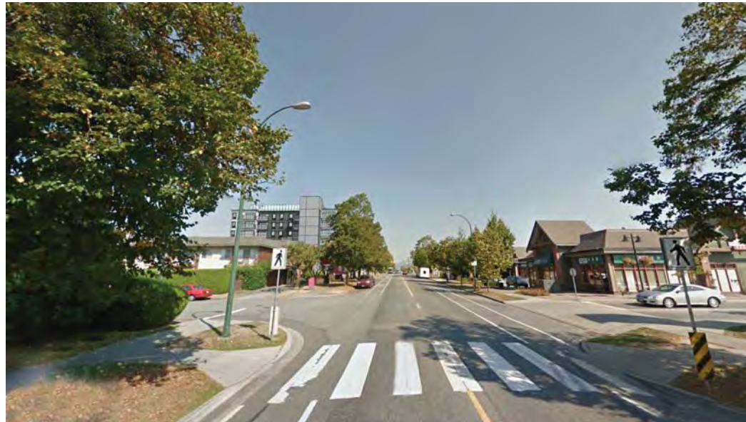
4 view analysis - kerr street looking north