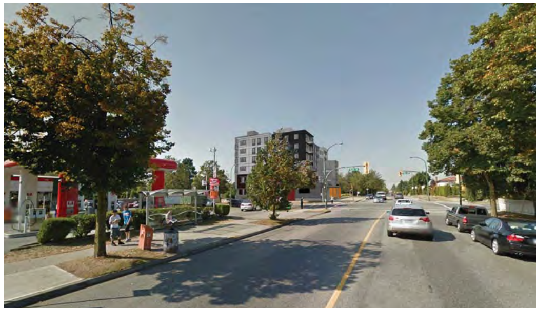
2 view analysis - 54th avenue looking west