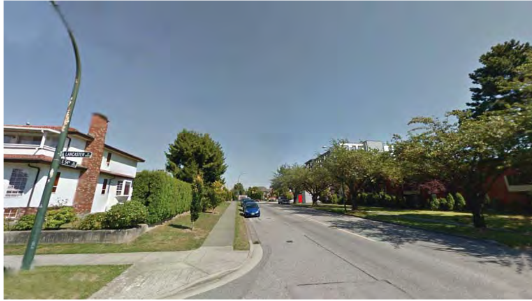
5 view analysis - 54th avenue looking east