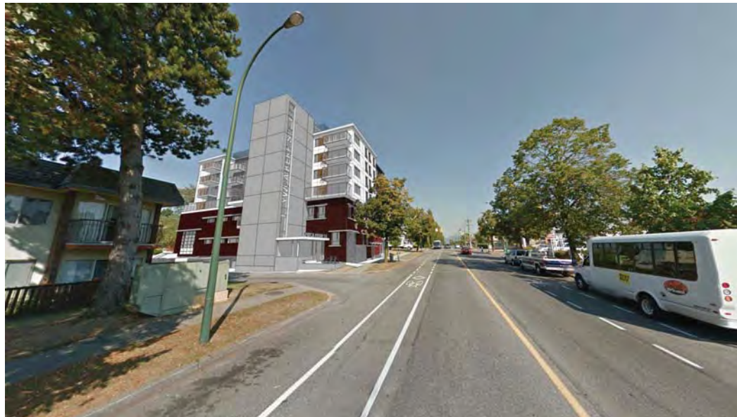
3 view analysis - kerr street looking north