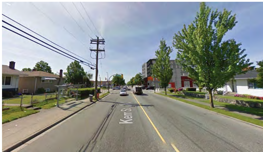
1 view analysis - kerr st looking south