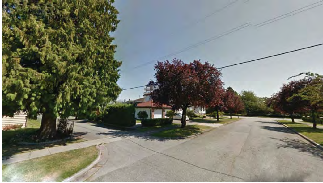
6 view analysis - lane looking south-east